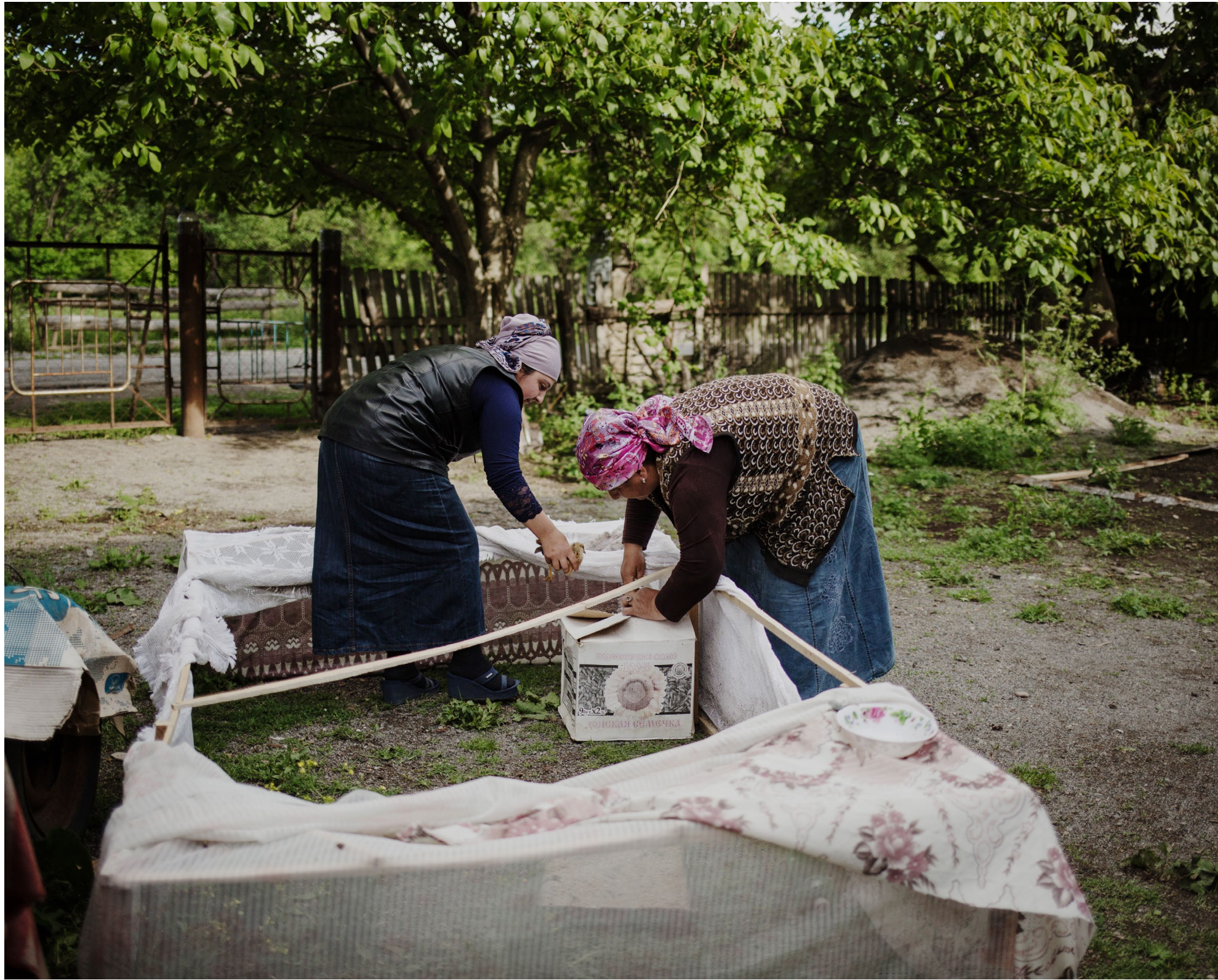
Abastoumani, Samtskhe-Javakheti, Georgia Meshkets take care of their chicks