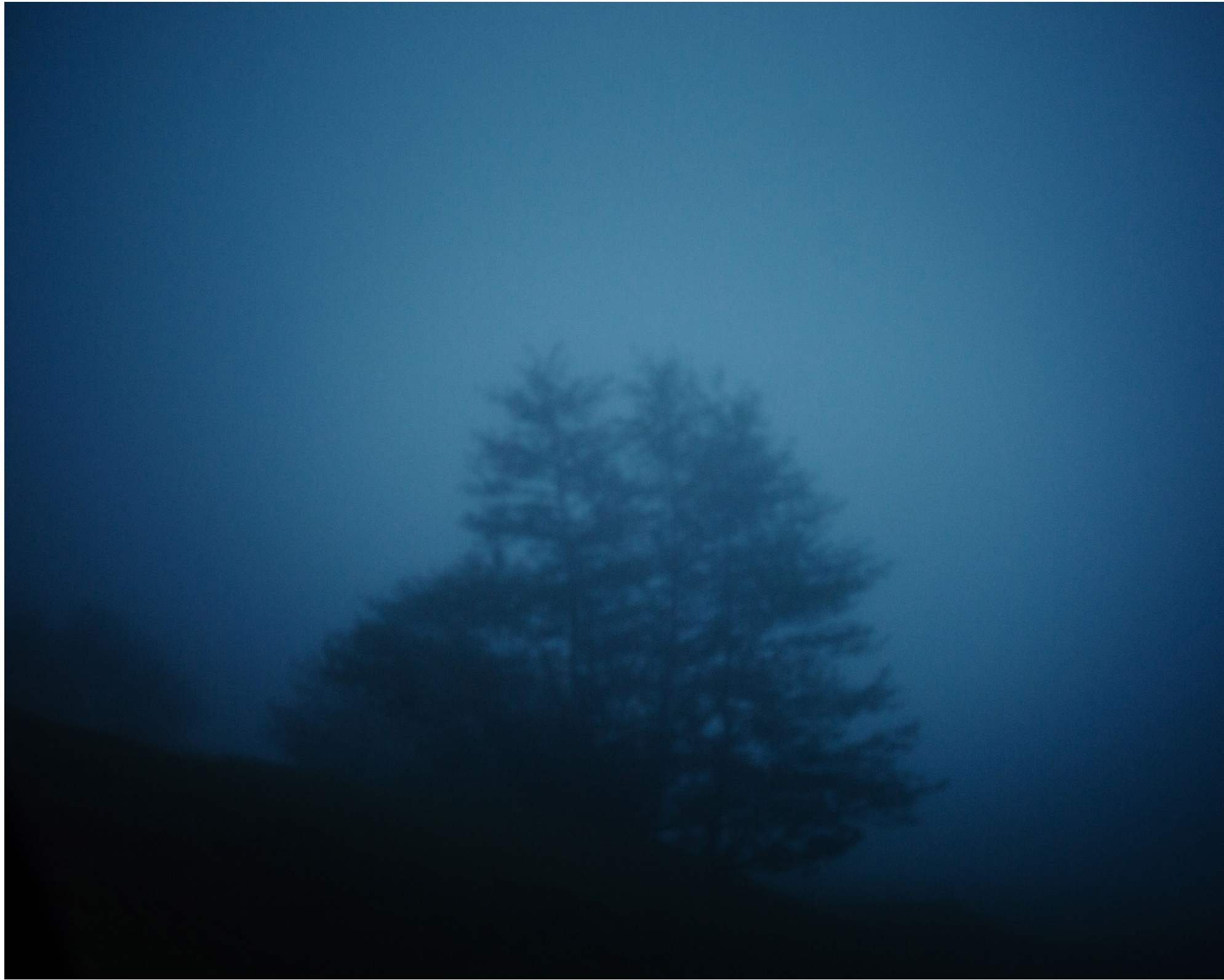
The road between Ghorjomi and Zortikheli, Adjara, Georgia