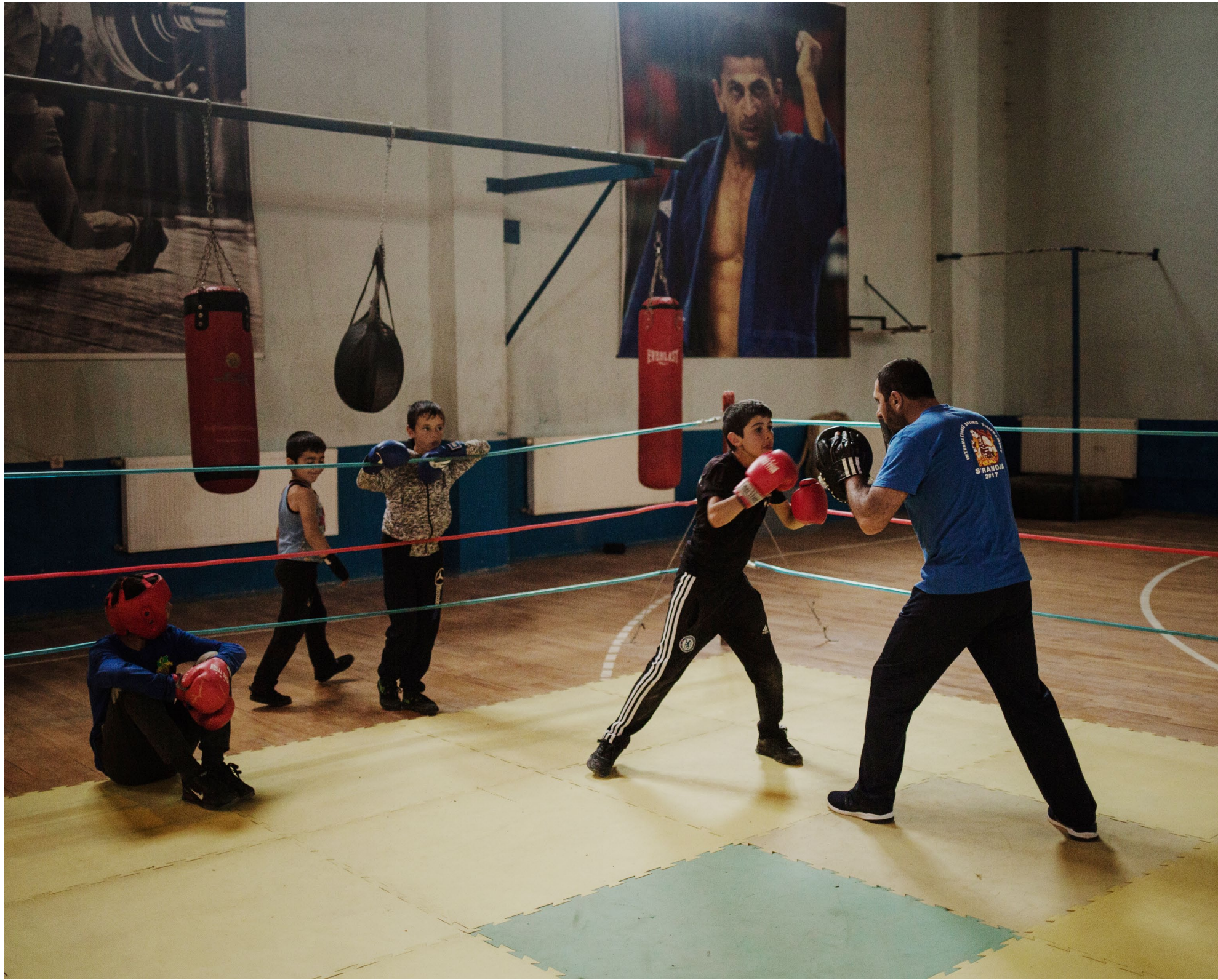
Akhalkalaki, Samtskhe-Javakheti, Georgia A boxing class in the city gymnasium.