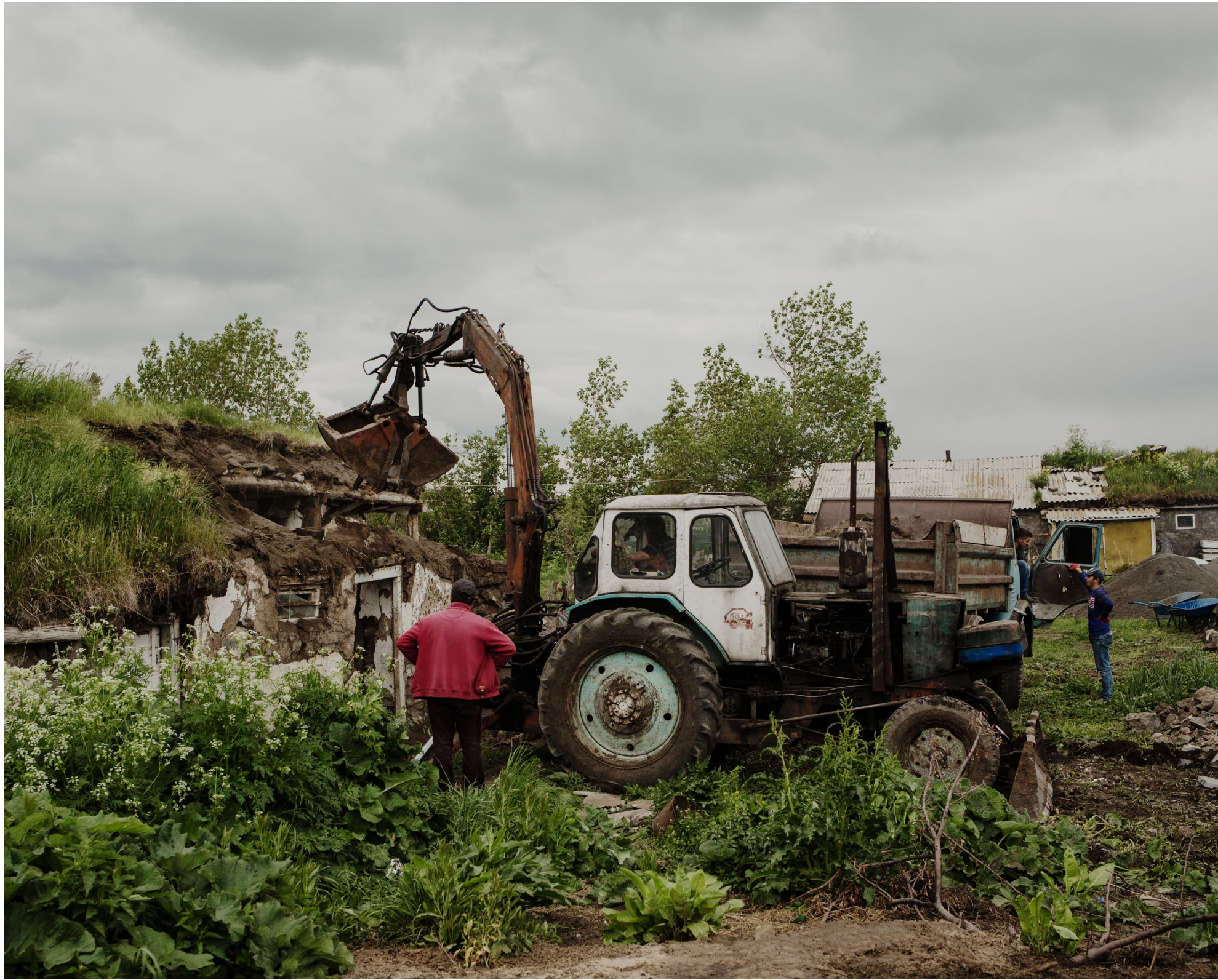
Gorelovka, Samtskhe-Javakheti, Georgia Armenians are destroying a traditional Doukhobor house to extend their house. Armenians and Adjarians are now the majority of the village.