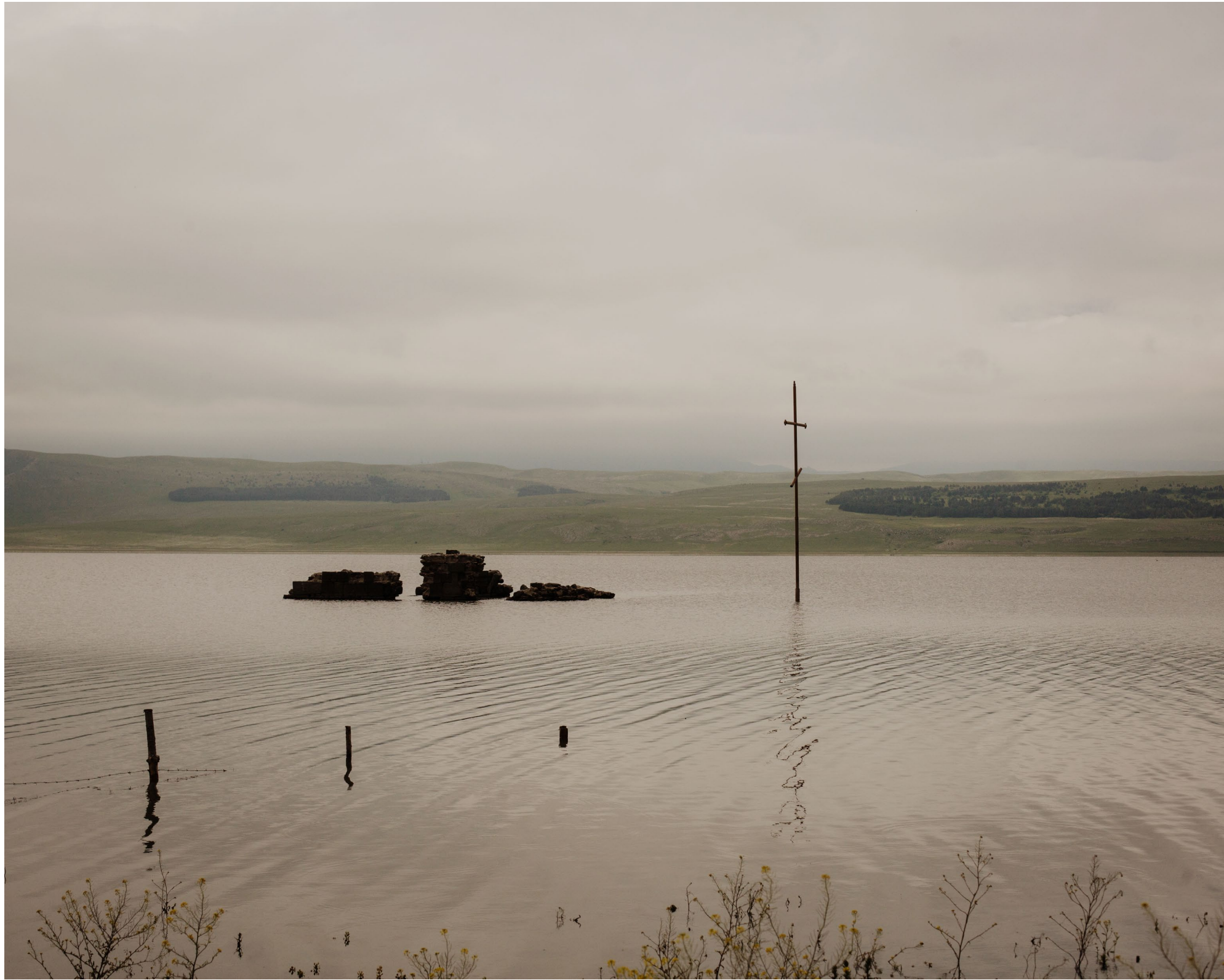
Tbeti, Kvemo Kartli, Georgia The vestiges of a church, in the Tsalka artificial lake.