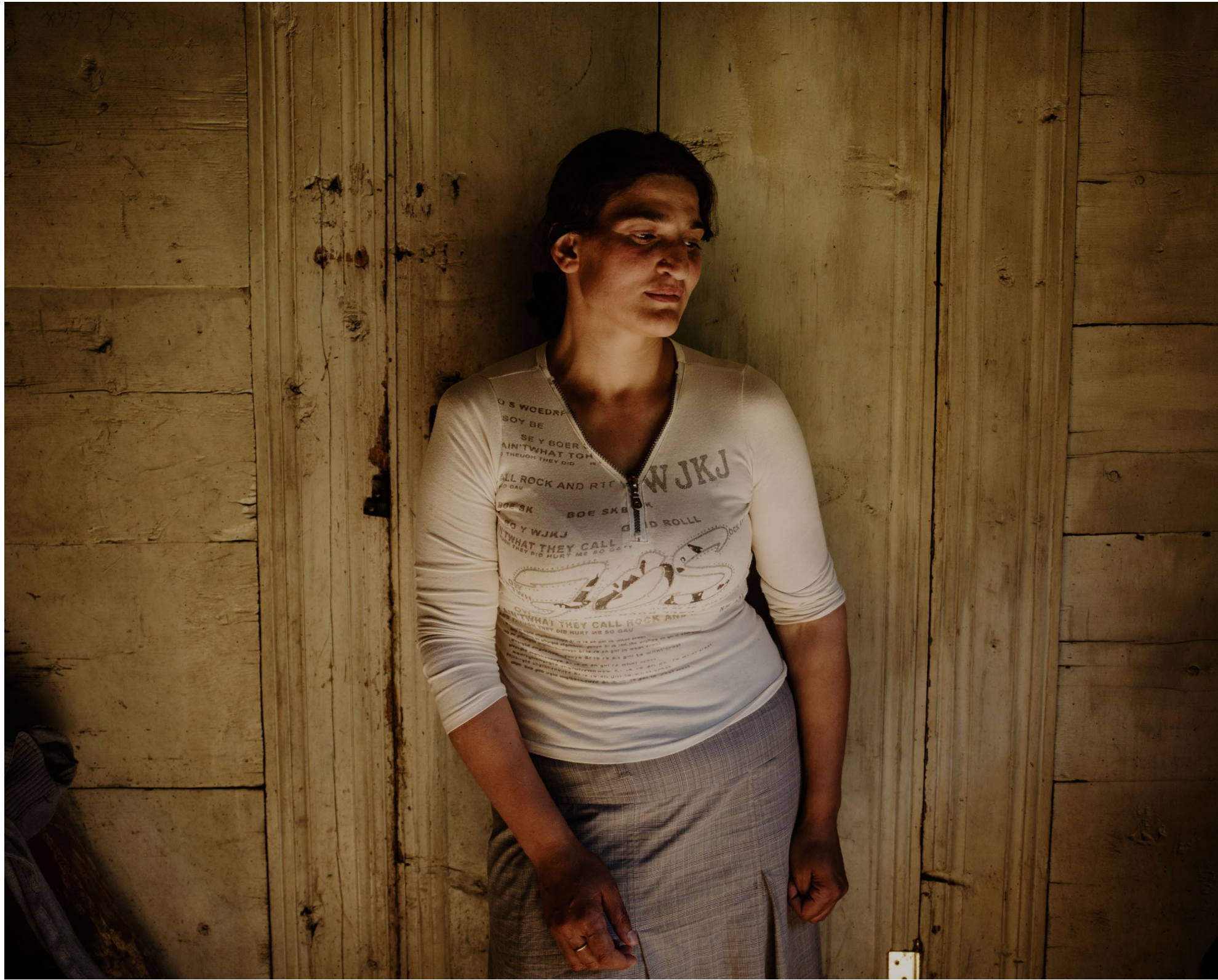
Ghorjomi, Adjara, Georgia An Adjarian woman in her house.