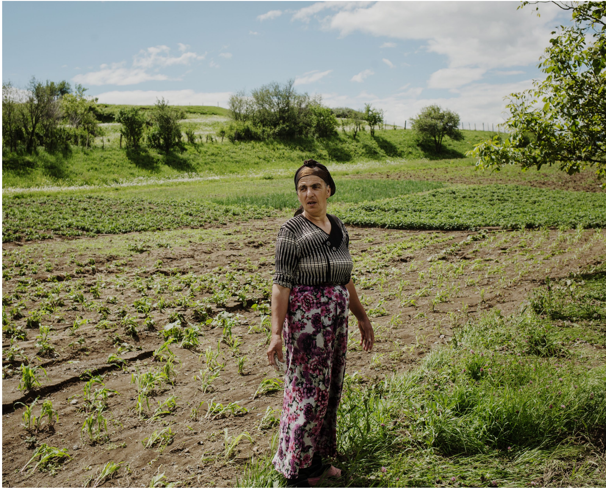
Abastoumani, Samtskhe-Javakheti, Georgia A meshket woman observes the damage in her garden after the floods the day before.