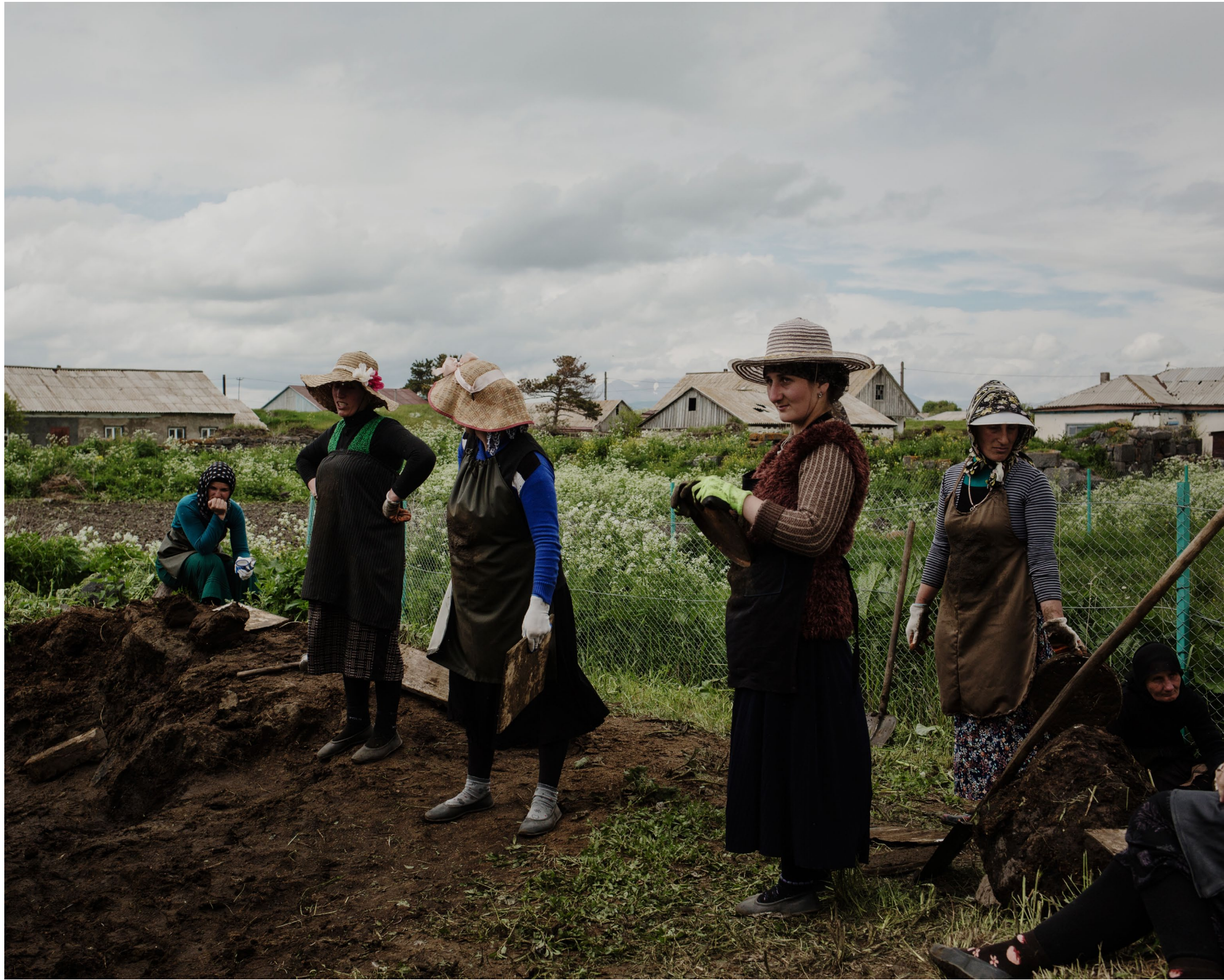
Gorelovka, Samtskhe-Javakheti, Georgia Adjarian women from Gorelovka are preparing heating bricks with cowpat.