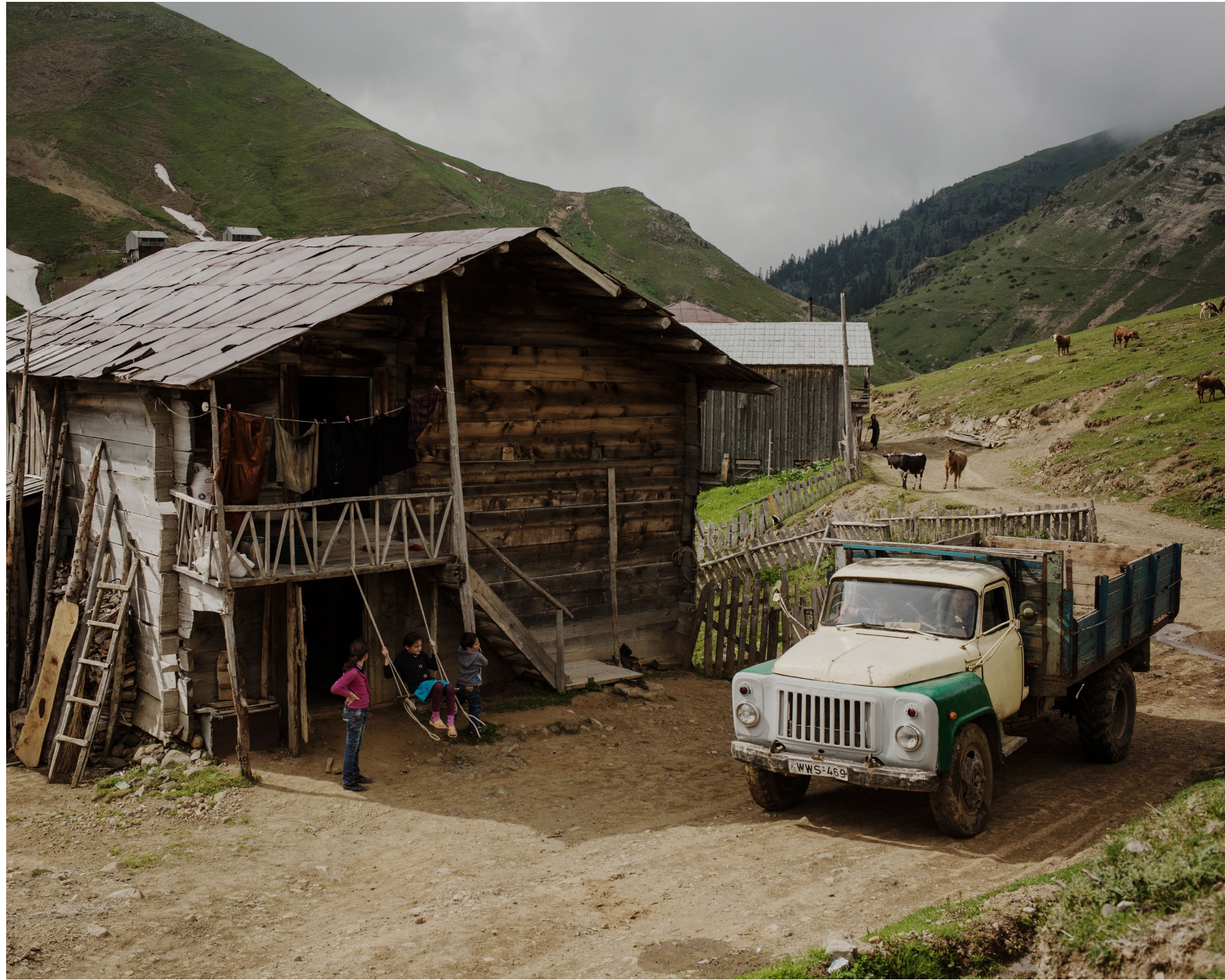
Zortikheli, Adjara, Georgia