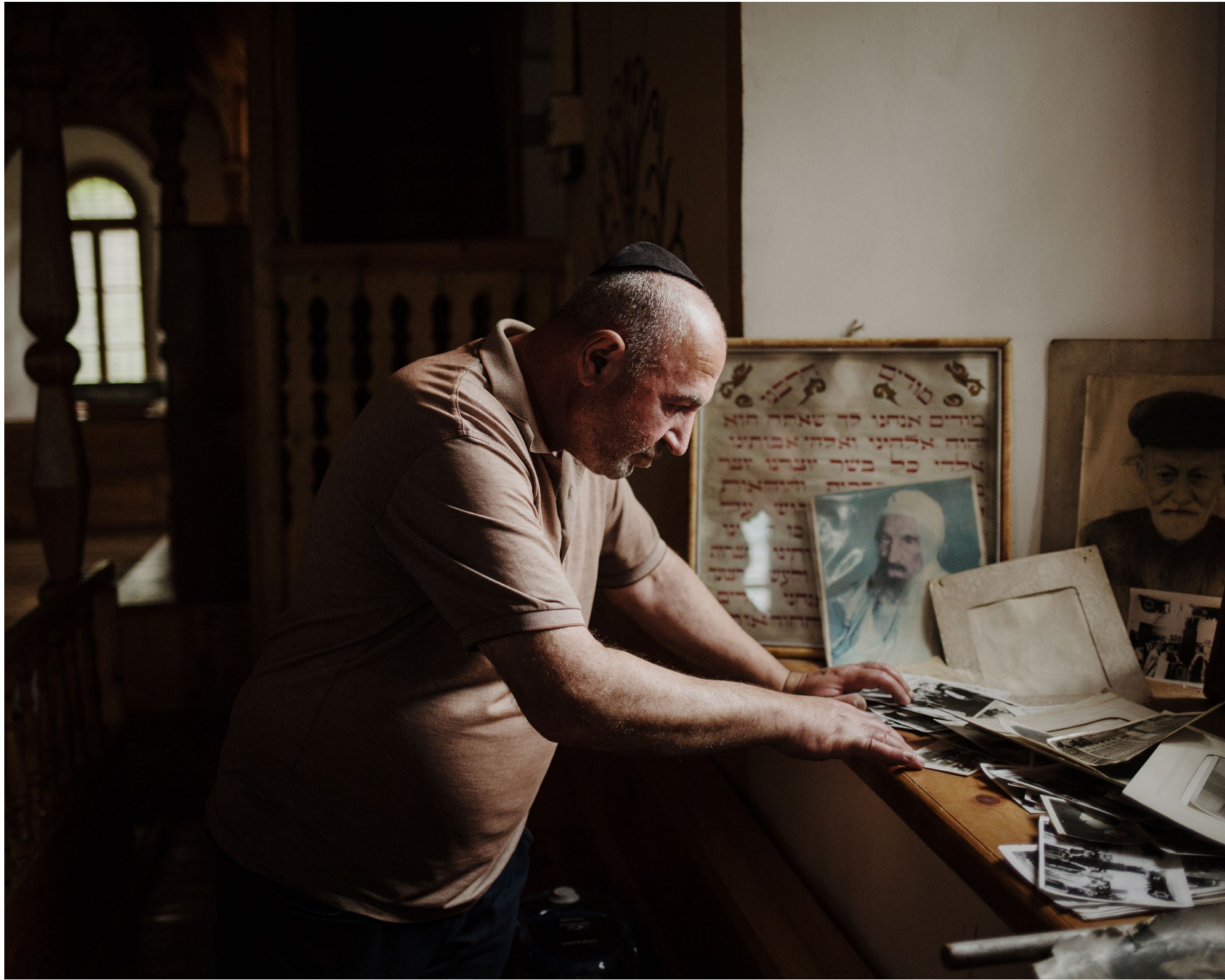
Akhaltsikhe, Samtskhe-Javakheti, Georgia The man who takes care daily of the synagogue.