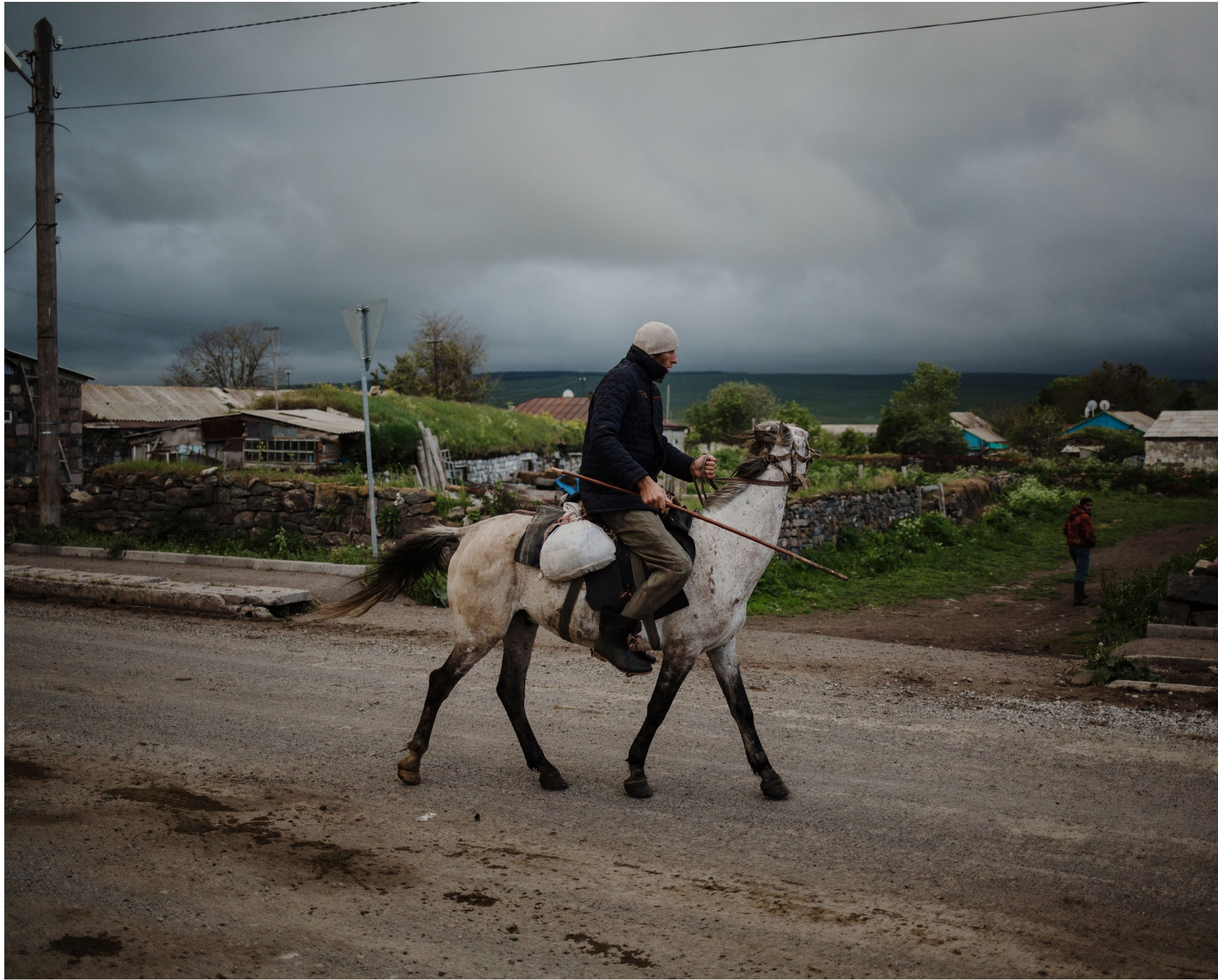
Gorelovka, Samtskhe-Javakheti, Georgia A sheperd and his horse.