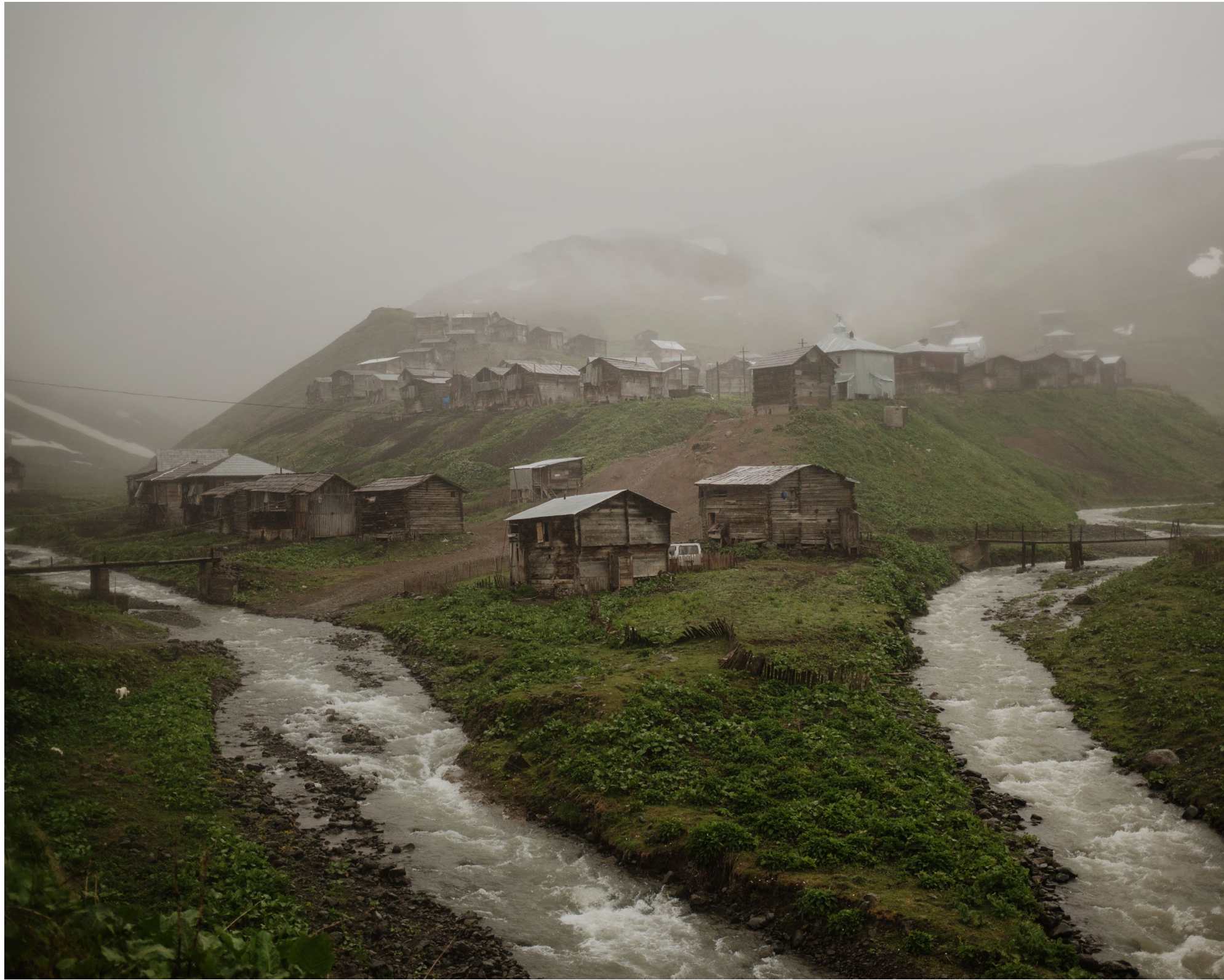
Zortikheli, Adjara, Georgia The village during a storm.