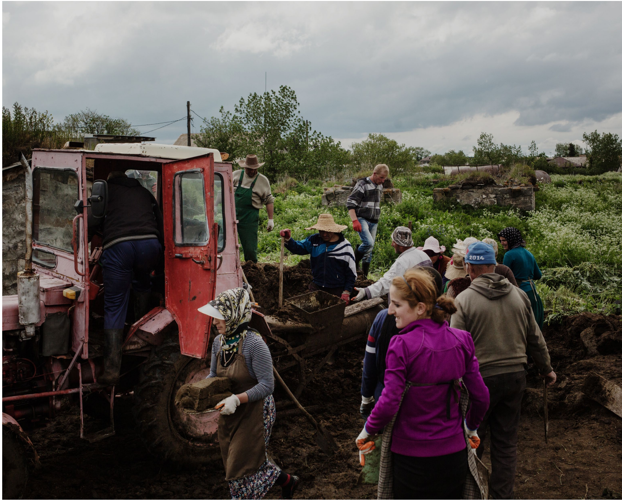
Gorelovka, Samtskhe-Javakheti, Georgia Adjarian women from Gorelovka are preparing heating bricks with cowpat.