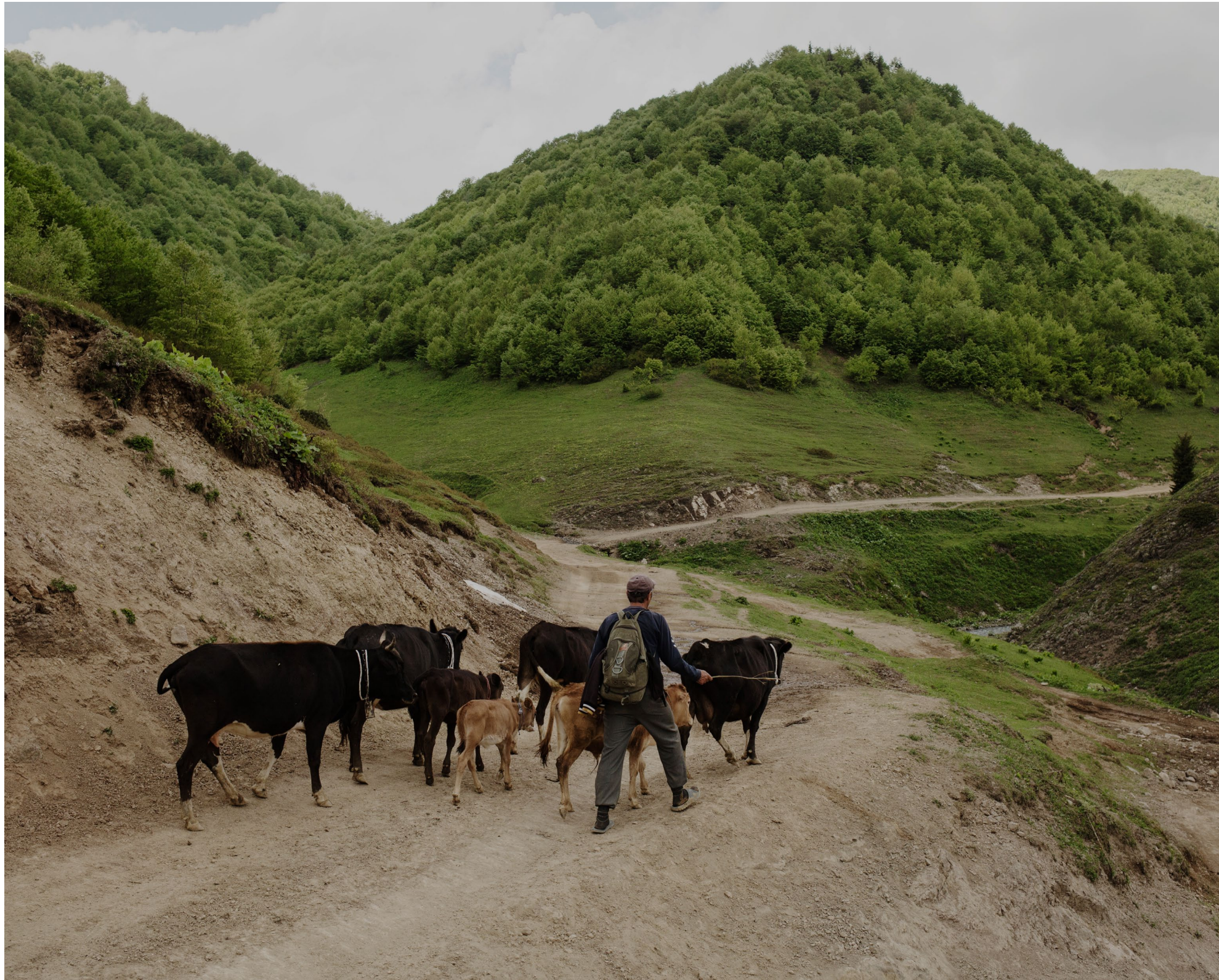
Adjara, Georgia On the road to Zortikheli, a man takes his cattle to the village.