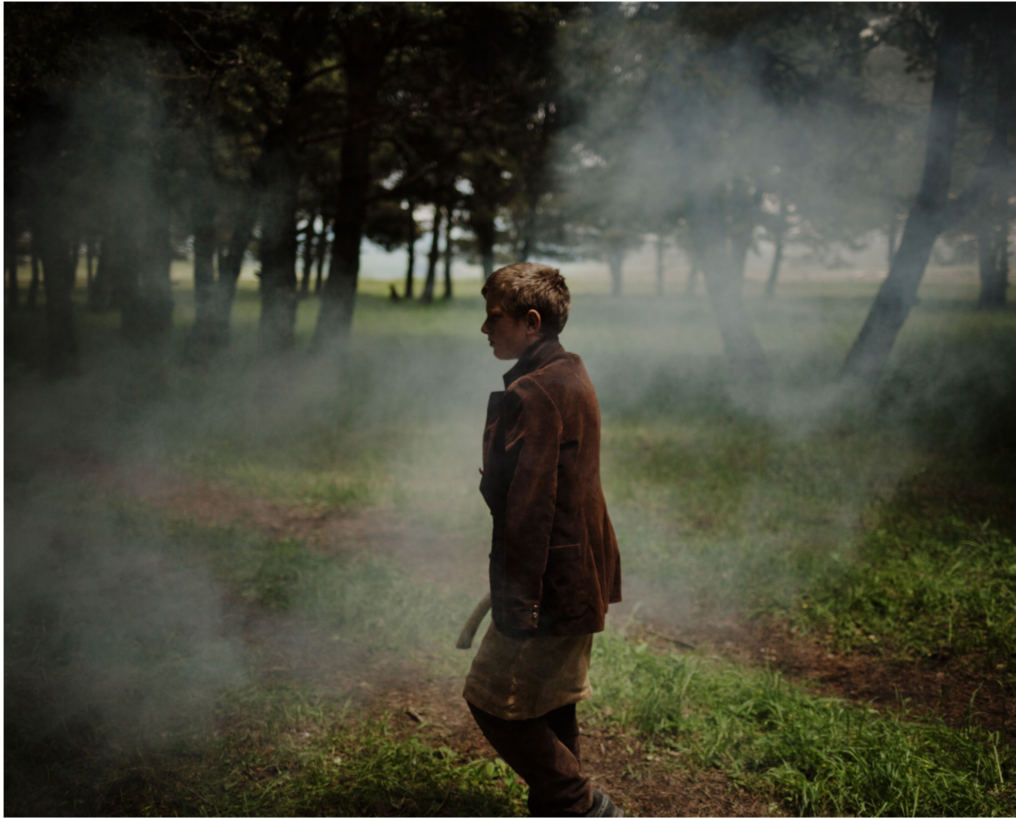
In a forest next to Gorelovka, Samtskhe-Javakheti, Georgia Kids acting a traditionnal Georgian tale about the God of the forest.