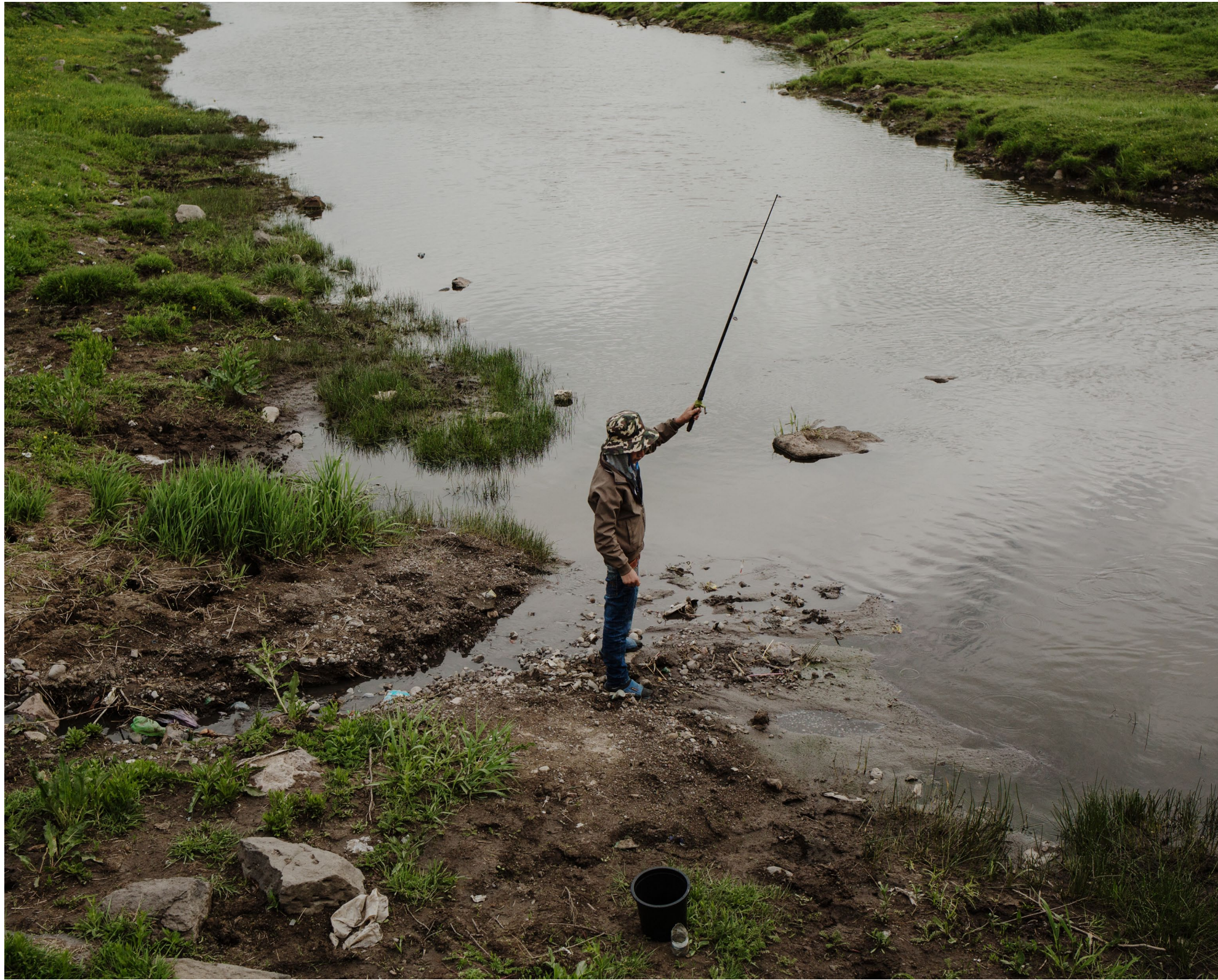
Gorelovka, Samtskhe-Javakheti, Georgia

A young man fishing in the very polluted small river which crosses the river.