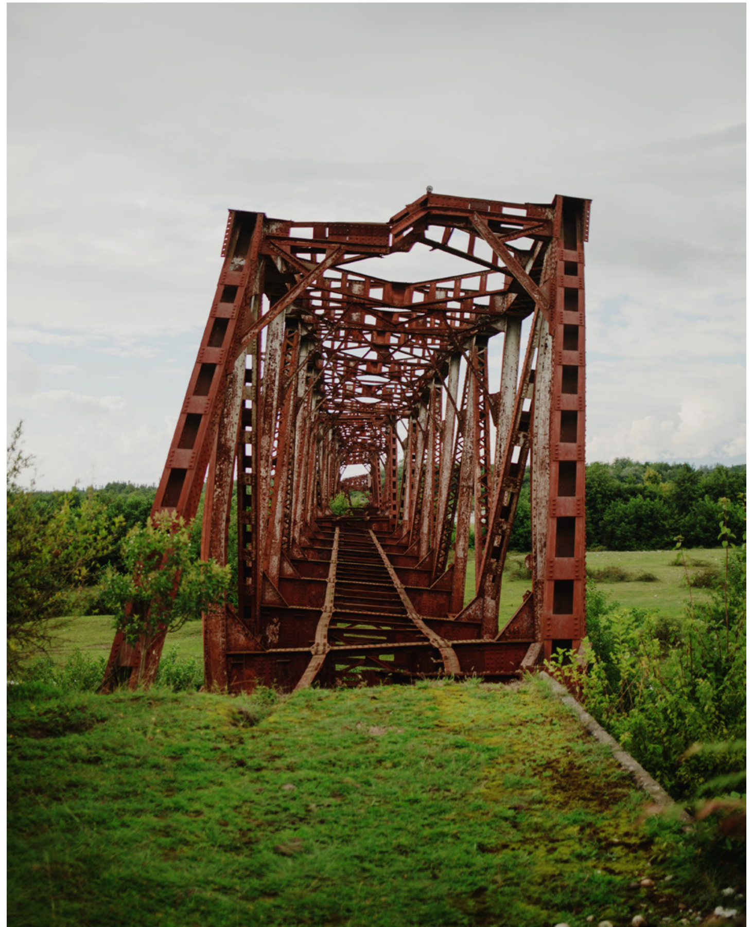
Shamgona, Samegrelo, Georgia - A destroyed bridge from the former railway linking Tbilisi and Moscow