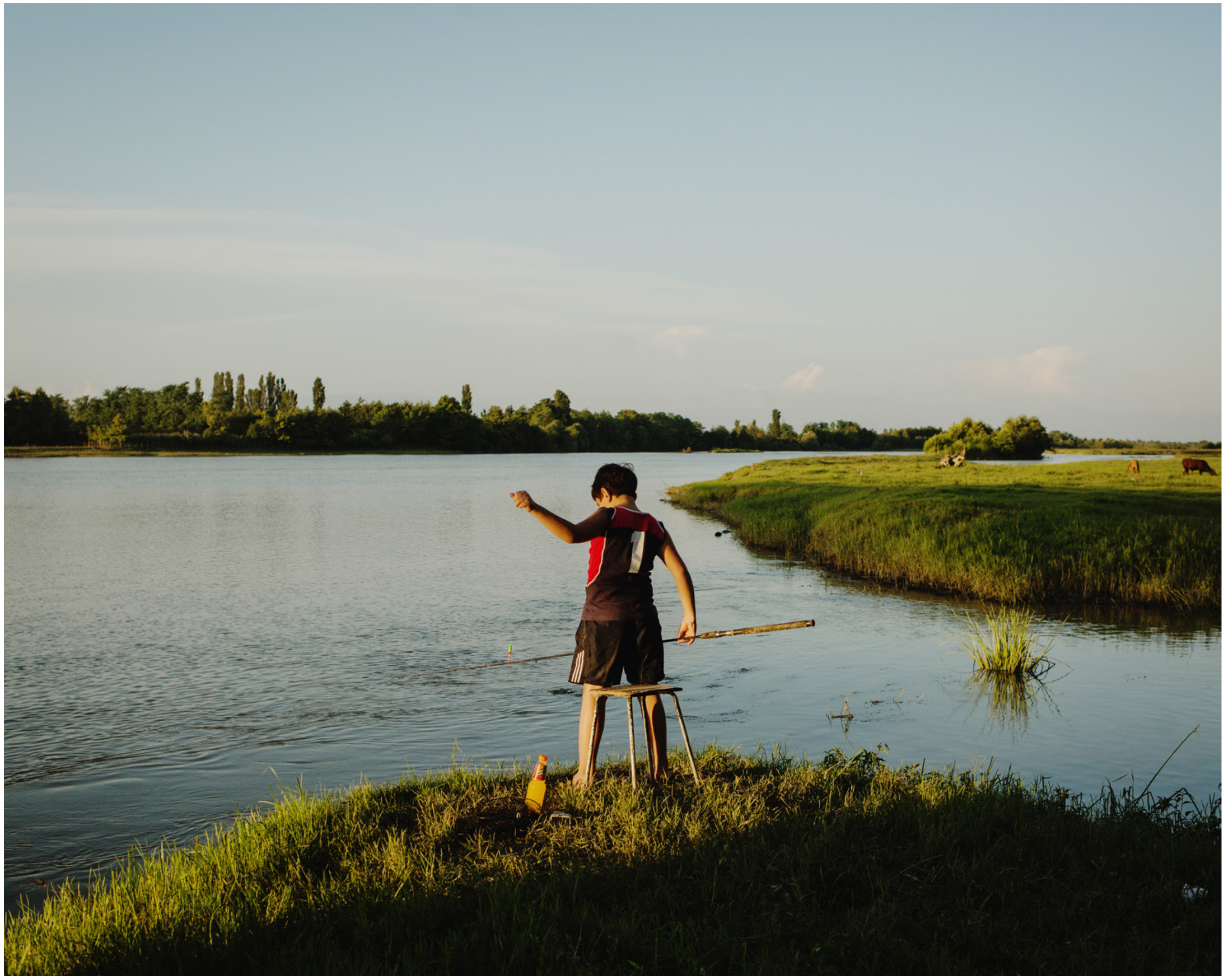
Anaklia, Samegrelo, Georgia - A young boy fishing on Enguri, in the village of Anaklia just before the Enguri meets the Black Sea.