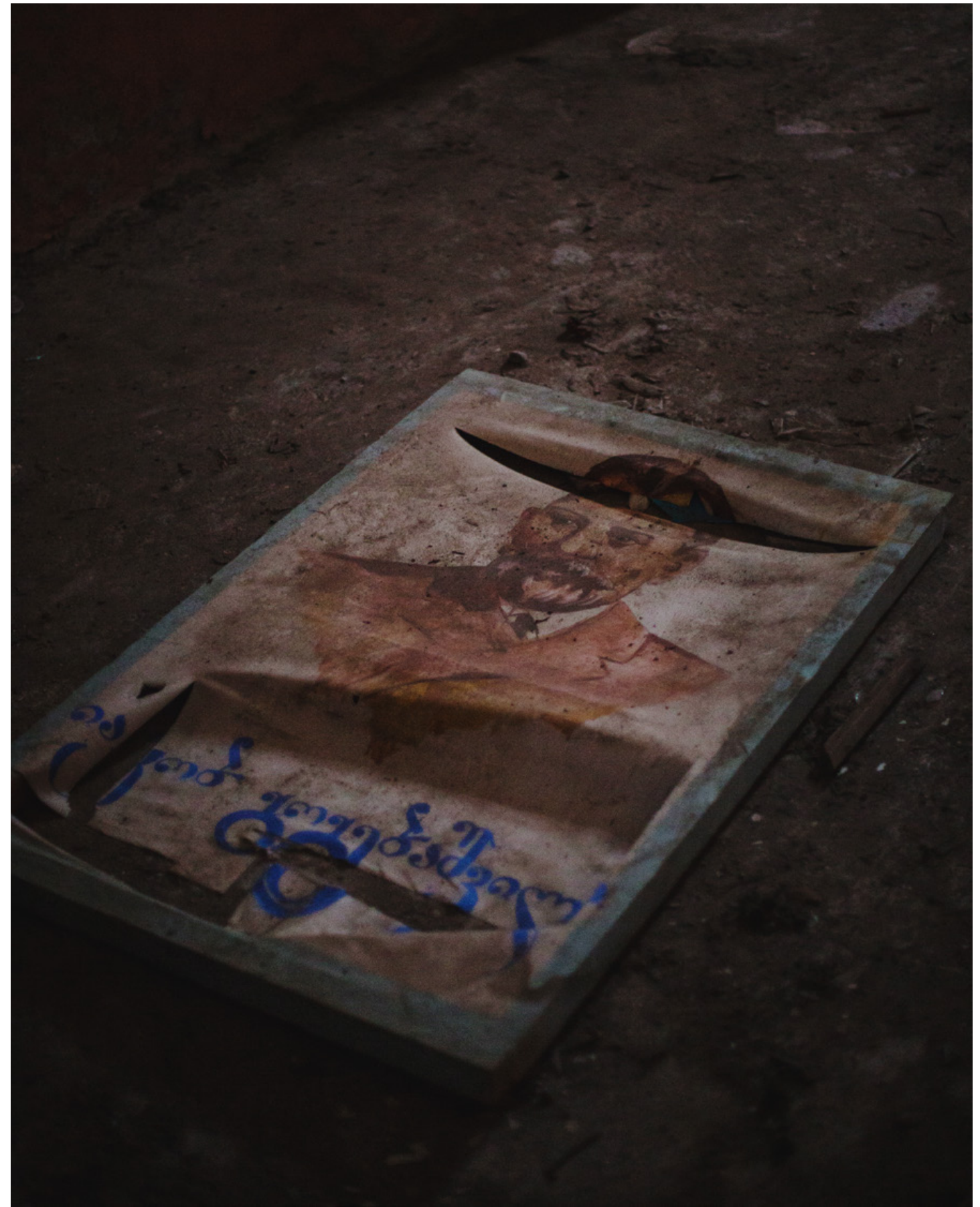
Shamgona, Samegrelo, Georgia - In the former school of the village, an abandoned portrait of Iakob Gogebashvili, a Georgian educator and writer.