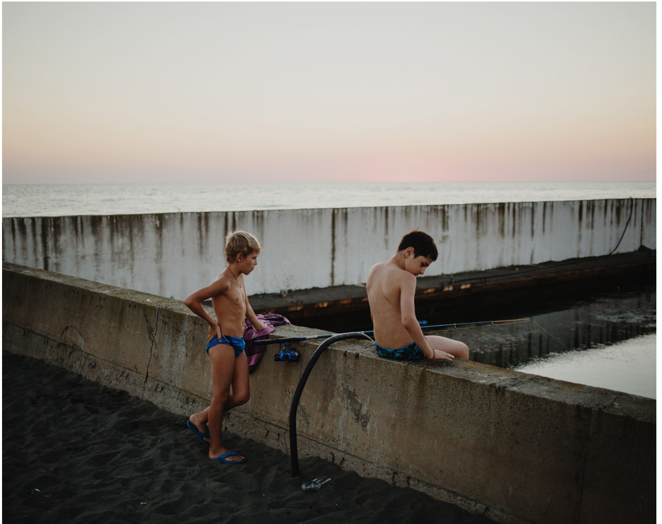
Anaklia, Samegrelo, Georgia - two young boys are fishing in the small and empty yacht port.