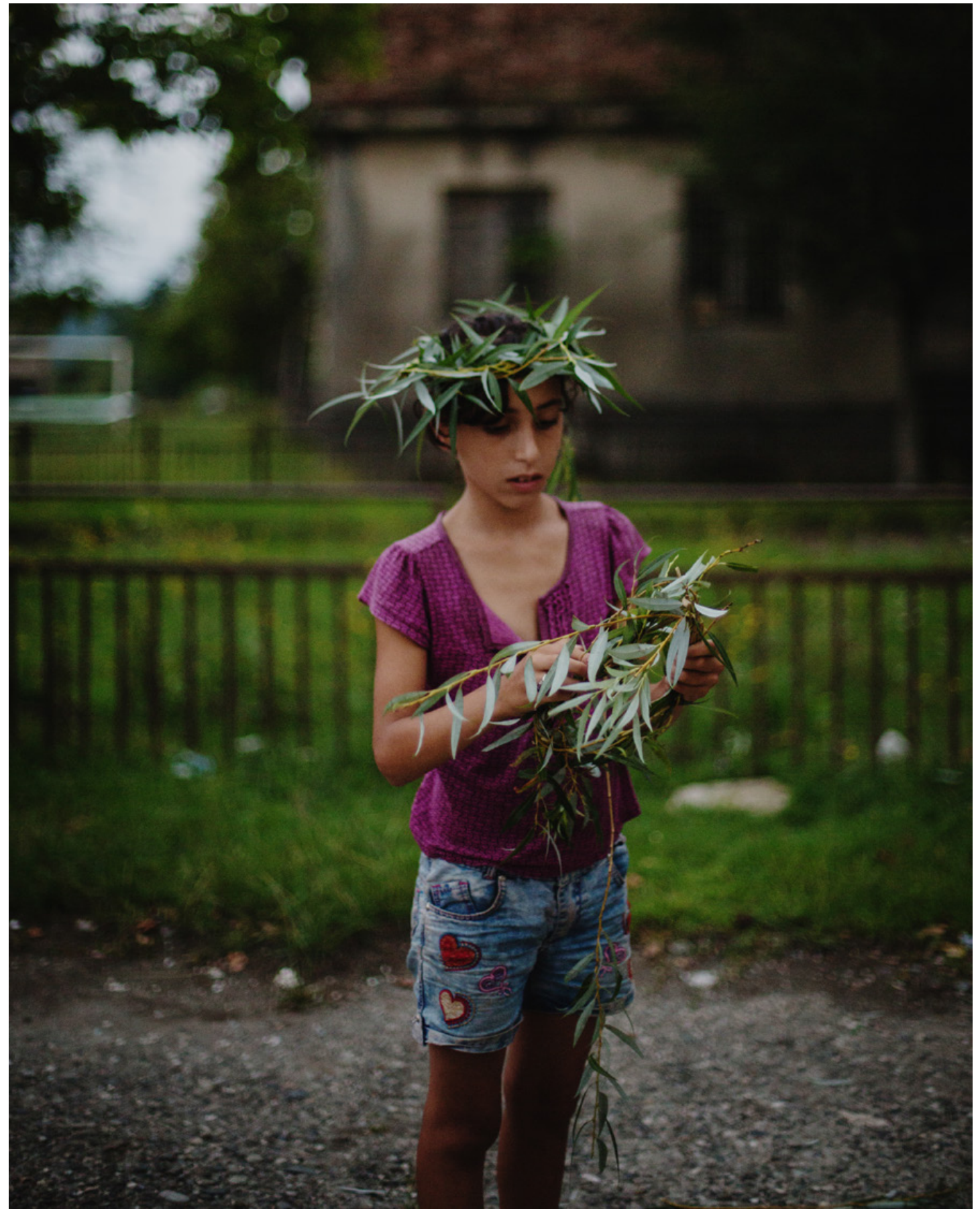
Potskho Etseri, Samegrelo, Georgia - Potskho Etseri is the former settlement of the Jvari dam workers. Today, only a few families of refugees are living here.