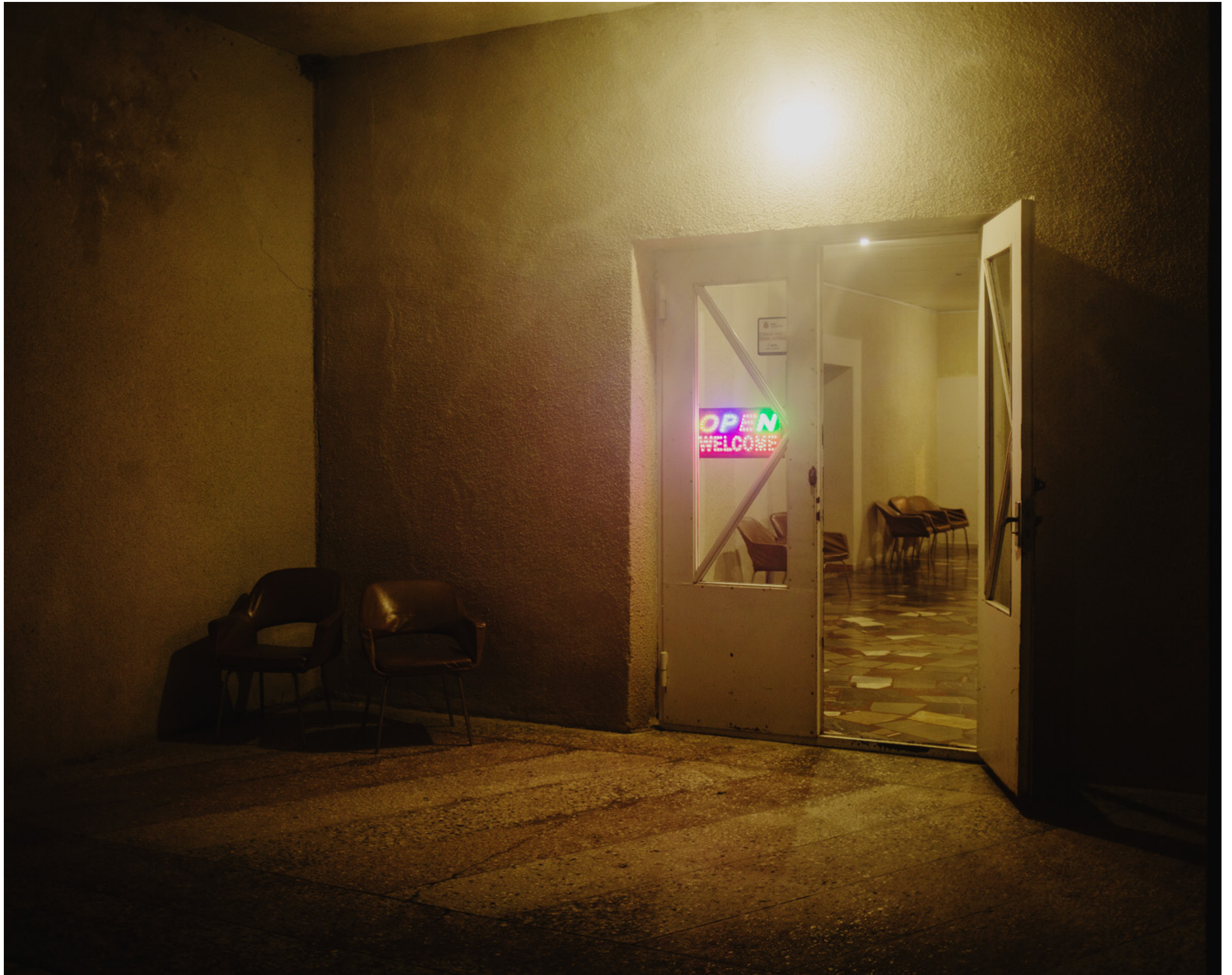
Potskho Etseri, Samegrelo, Georgia - Potskho Etseri is the former settlement of the Jvari dam workers. Today, only a few families of refugees are living here. The hotel Enguri entrance.