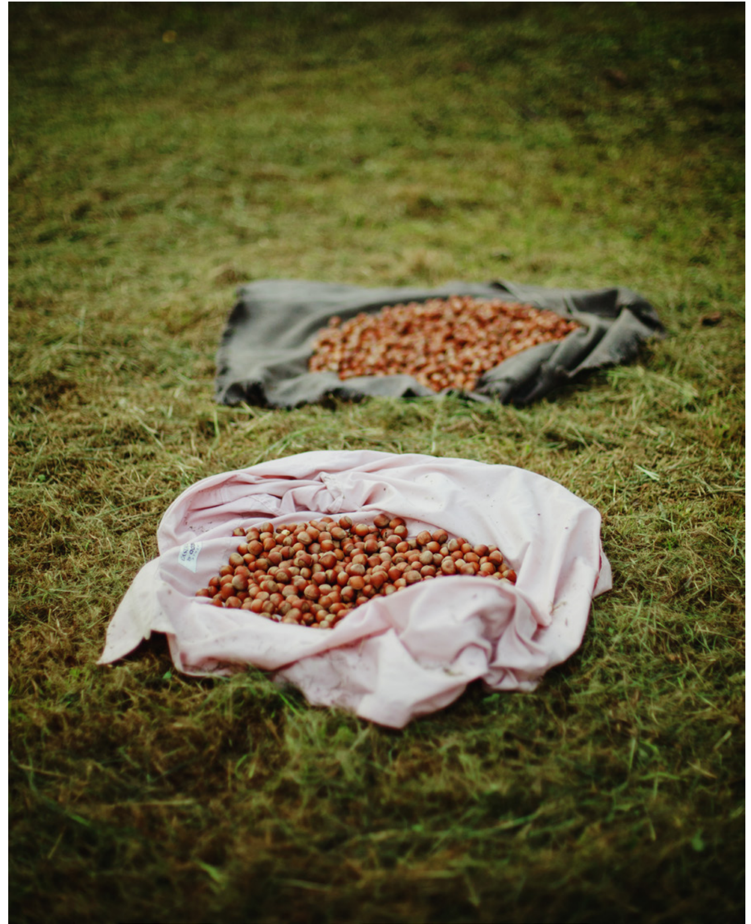
Shamgona, Samegrelo, Georgia - Hazelnut is one of the main income of the inhabitants of the region