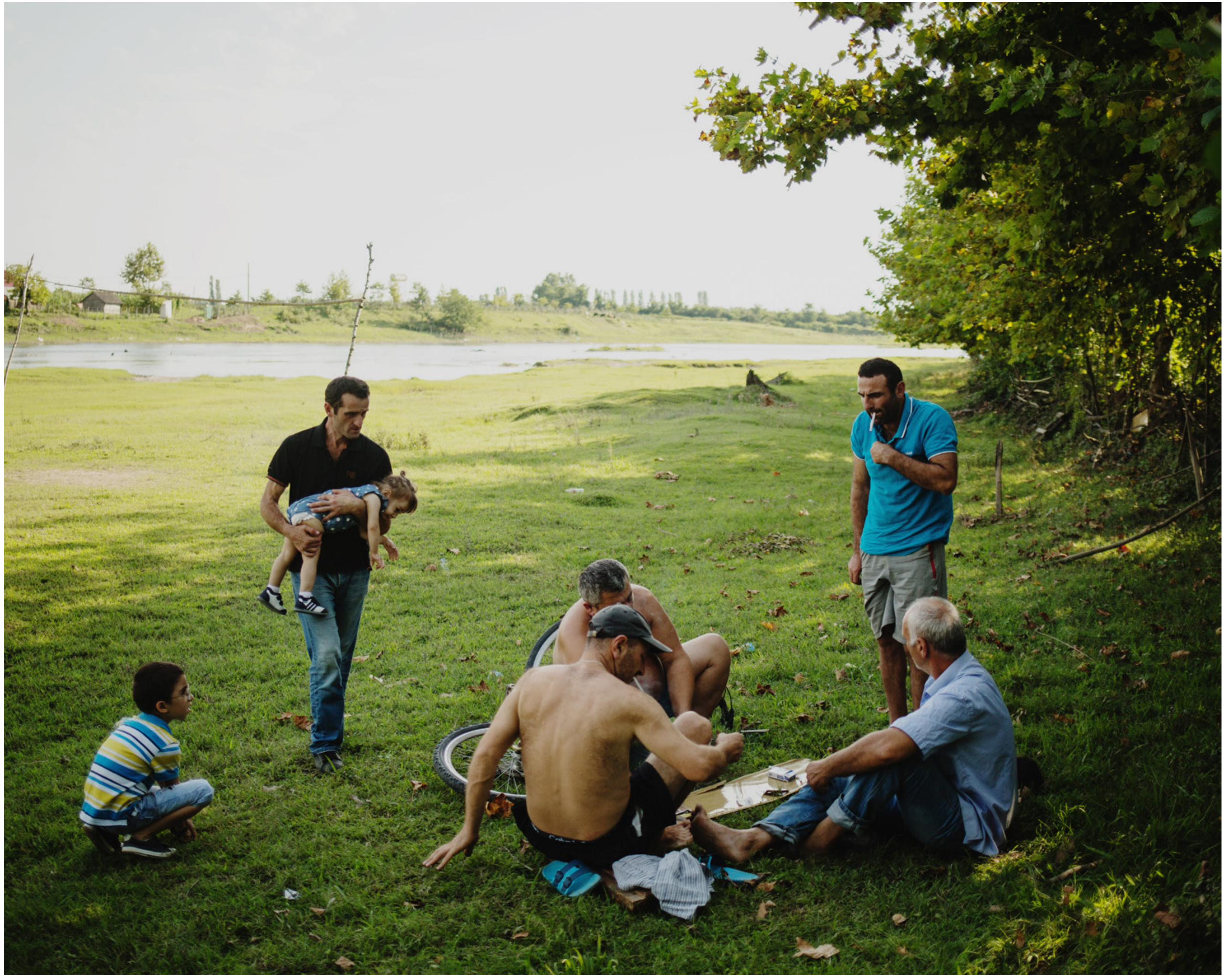
Ganarjiis Mukhuri, Samegrelo, Georgia - The village is located on the other bank of Enguri, the "border" with Abkhazia is one kilome- ter from the village.