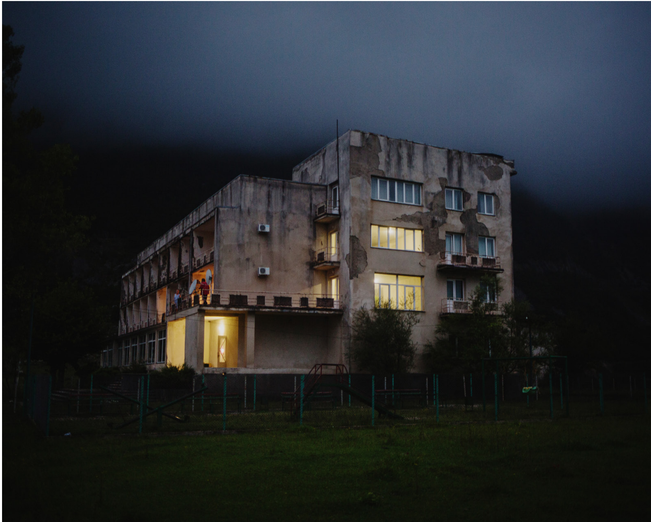
Potskho Etseri, Samegrelo, Georgia - Potskho Etseri is the former settlement of the Jvari dam workers. Today, only a few families of refugees are living here. The hotel Enguri hosts the few travellers coming here and guest workers of the dam...