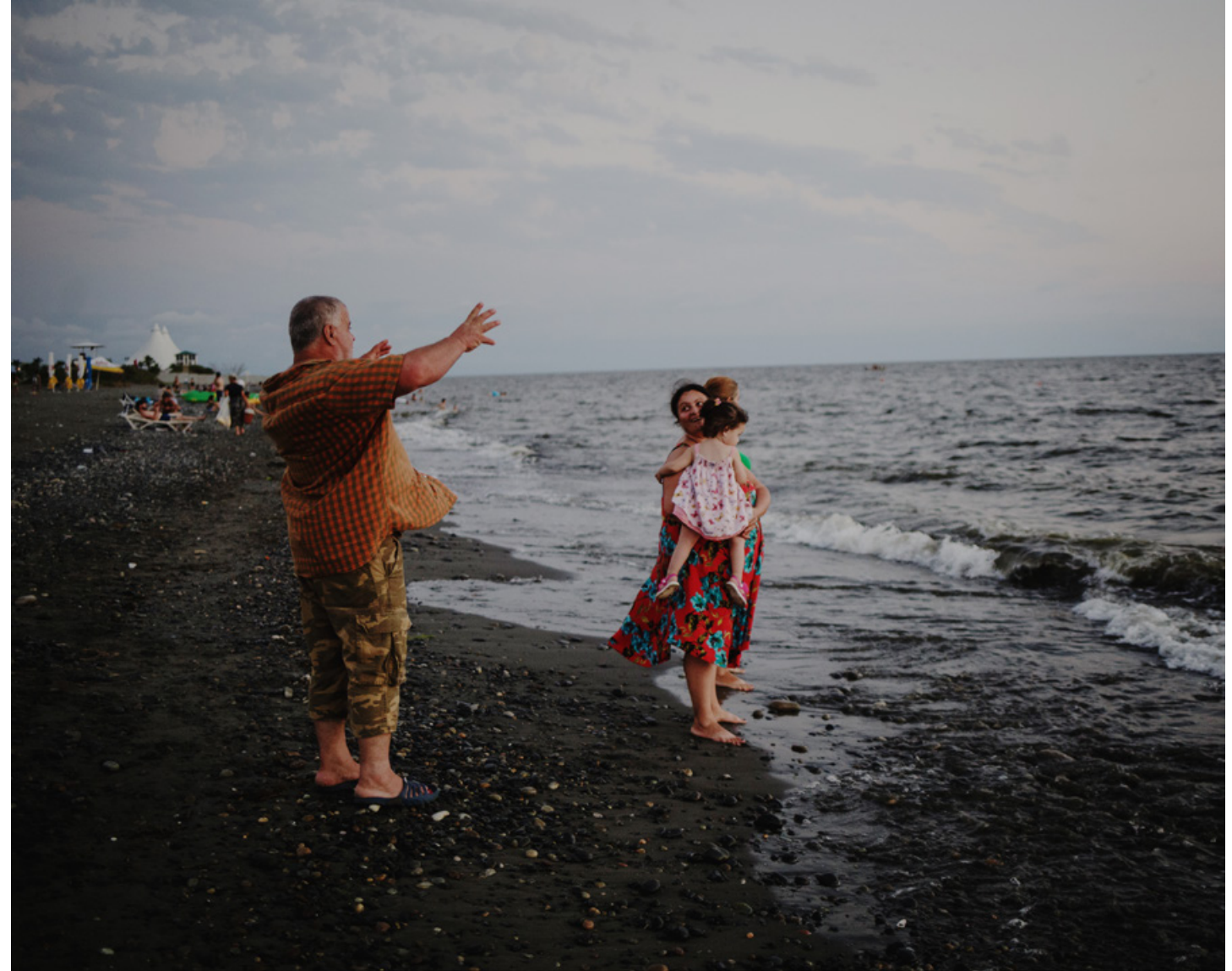
Ganarjiis Mukhuri, Samegrelo, Georgia - The beach