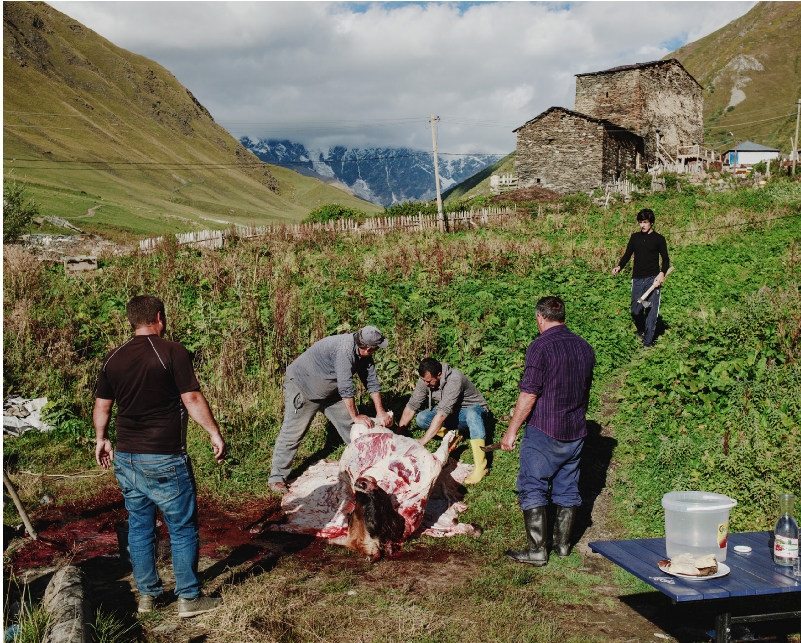
Ushguli, Svaneti, Georgia - some men just killed a cow and are slowly cutting the meat.