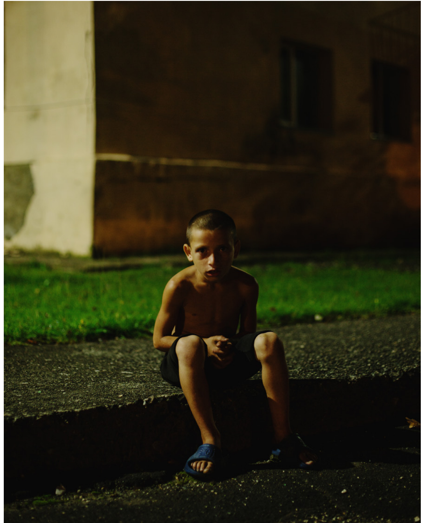
Potskho Etseri, Samegrelo, Georgia - Potskho Etseri is the former settlement of the Jvari dam workers. Today, only a few families of refugees are living here.