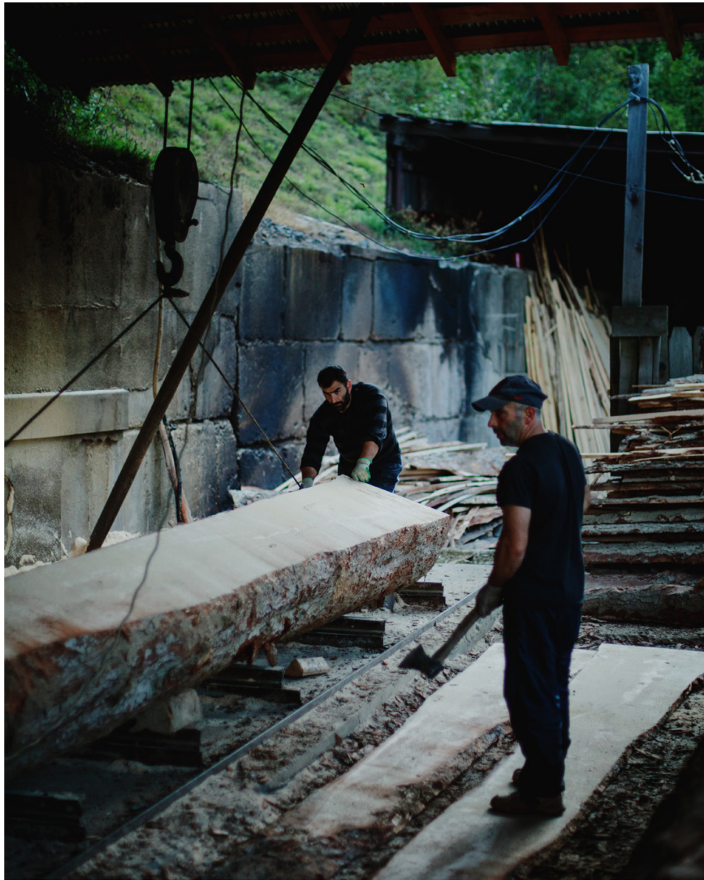
Khaishi, Svaneti, Georgia - Workers in a sawmill, one of the main economic activities of Svaneti. Transformed wood is then exported to Russia, Turkey, etc