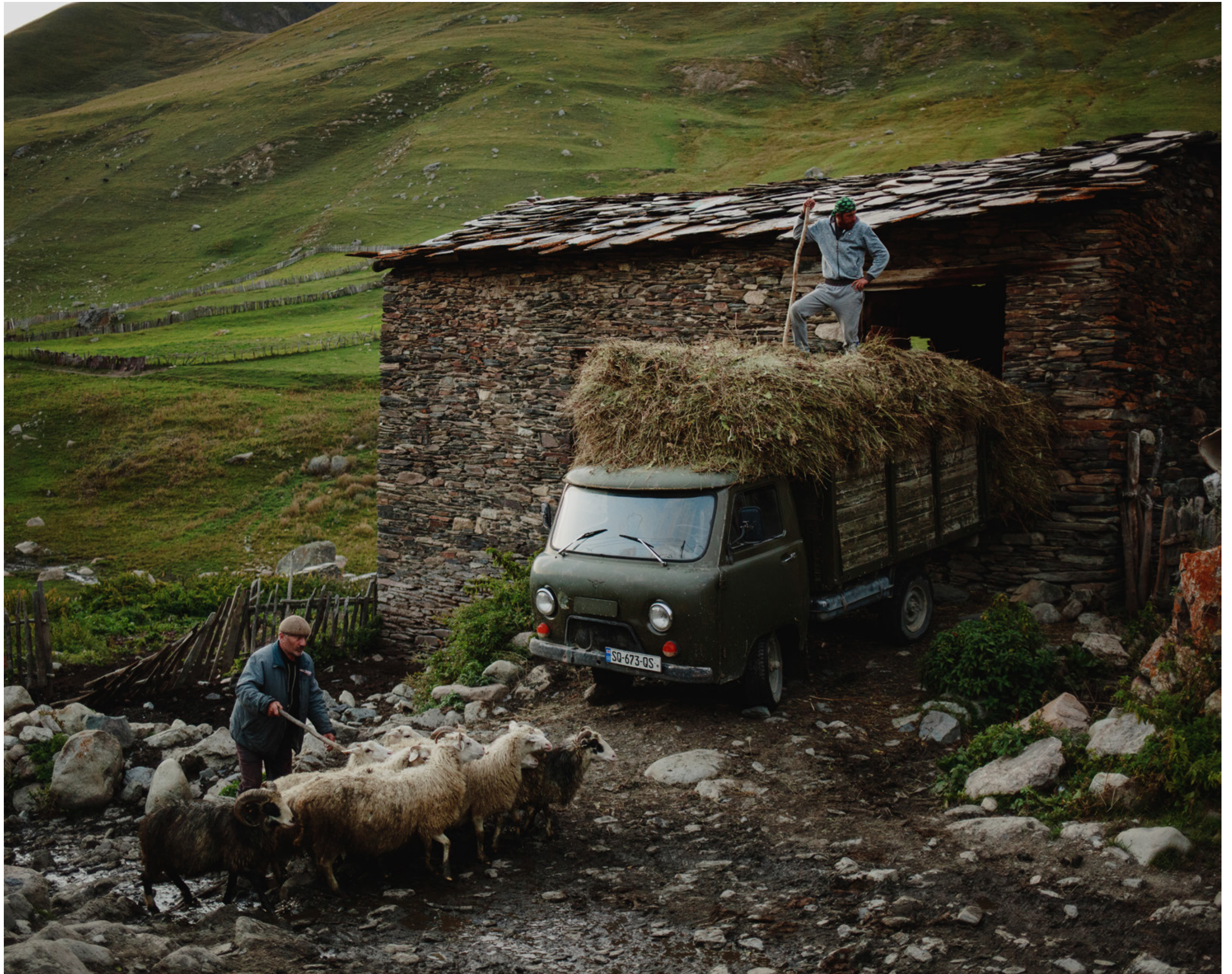
Ushguli, Svaneti, Georgia - Just before, he did the same with his sheep.