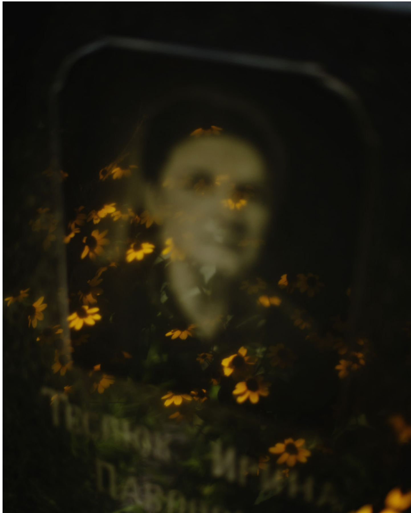
Potskho Etseri, Samegrelo, Georgia - Potskho Etseri is the former settlement of the Jvari dam workers. Today, only a few families of refugees are living here. Flowers reflection on a grave in the small cemetery of the village.