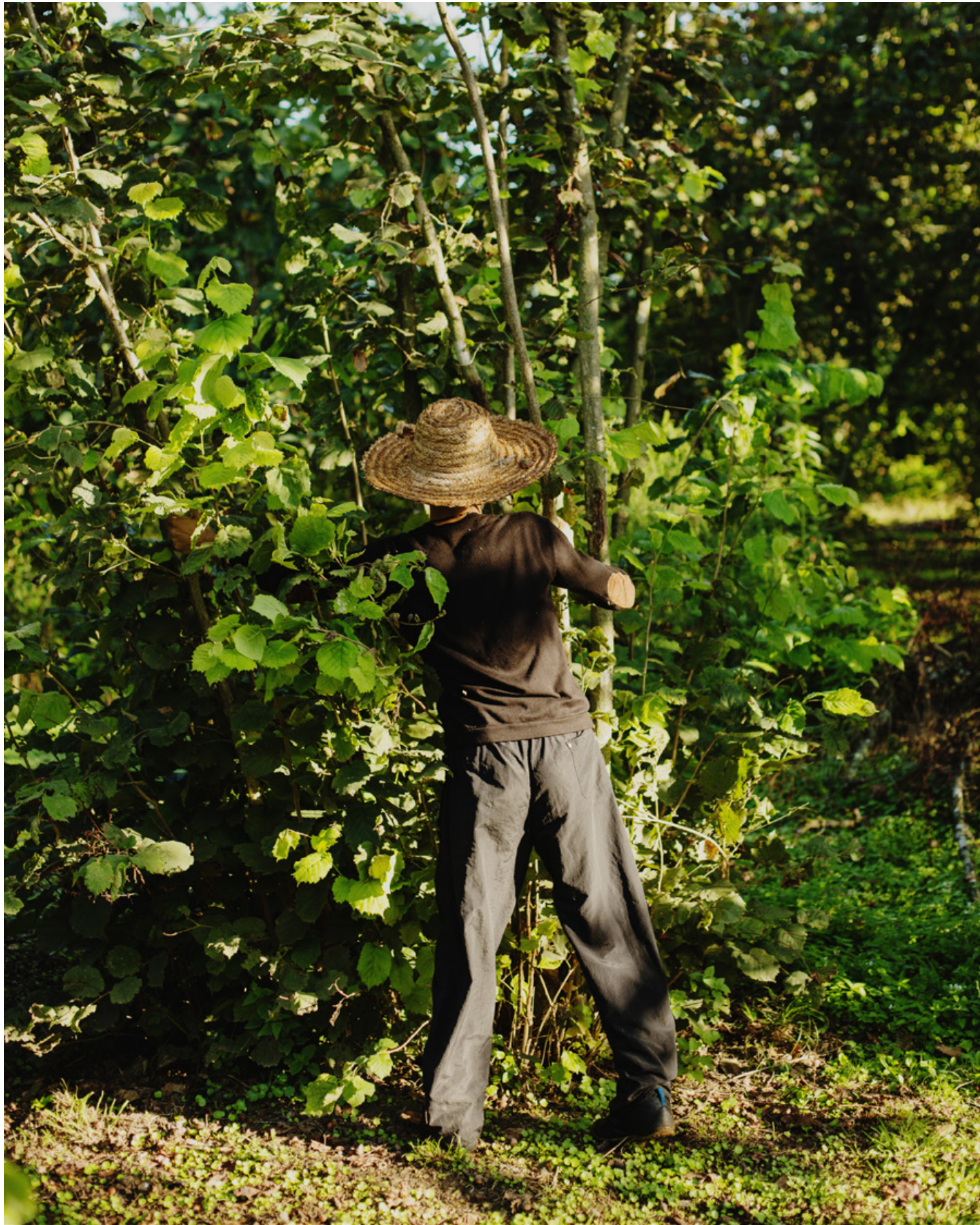
Shamgona, Samegrelo, Georgia - Hazelnut is one of the main income of the inhabitants of the region