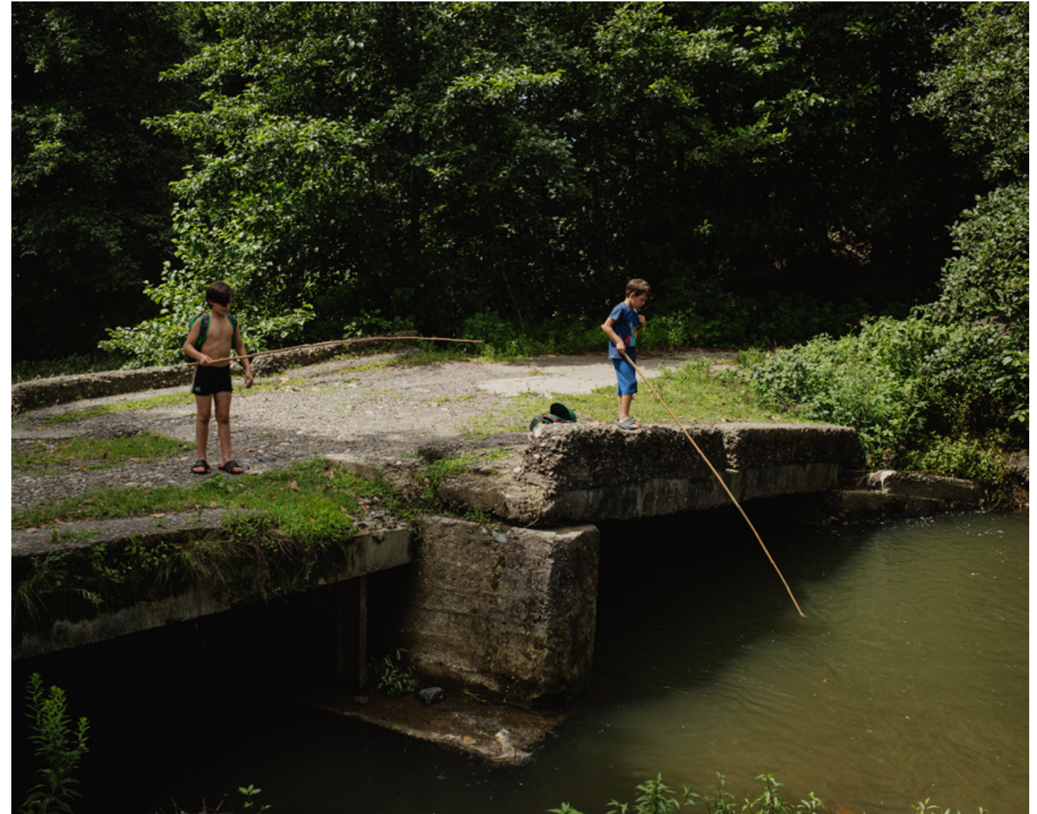
The Khurcha Bridge (on an affluent of Enguri) is a former crossing point between Georgia and Abkhazia. It was unilaterally closed by the Abkhaz authorities. Today children are fishing on it, just on the other side, the Russian border guards are present. A Georgian man was murdered there by an Abkhaz guard in 2016.