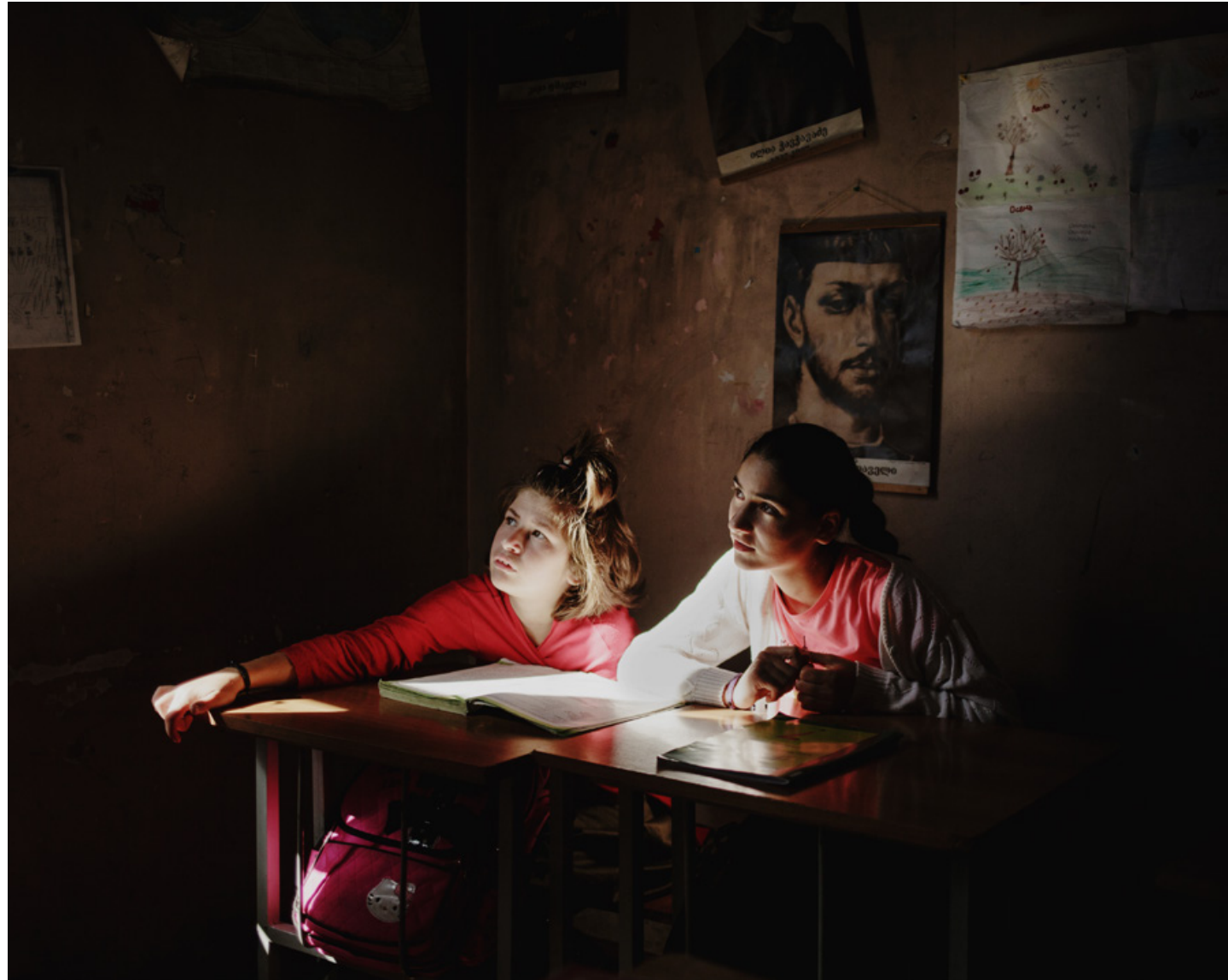
Ieli, Svaneti, Georgia - In the village school