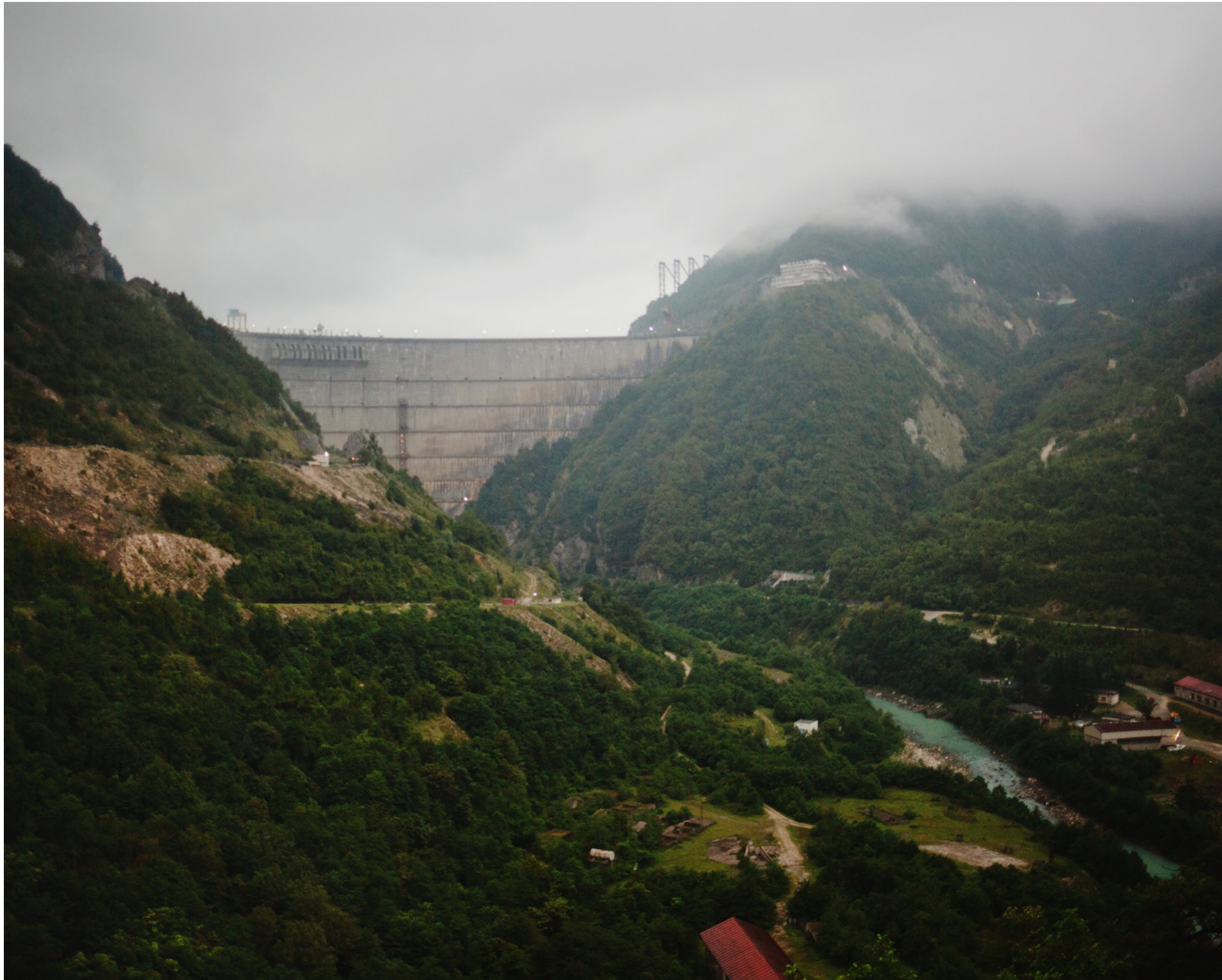
The Jvari dam seen from Potskho Etseri. It is the world's 4th tallest arch dam.