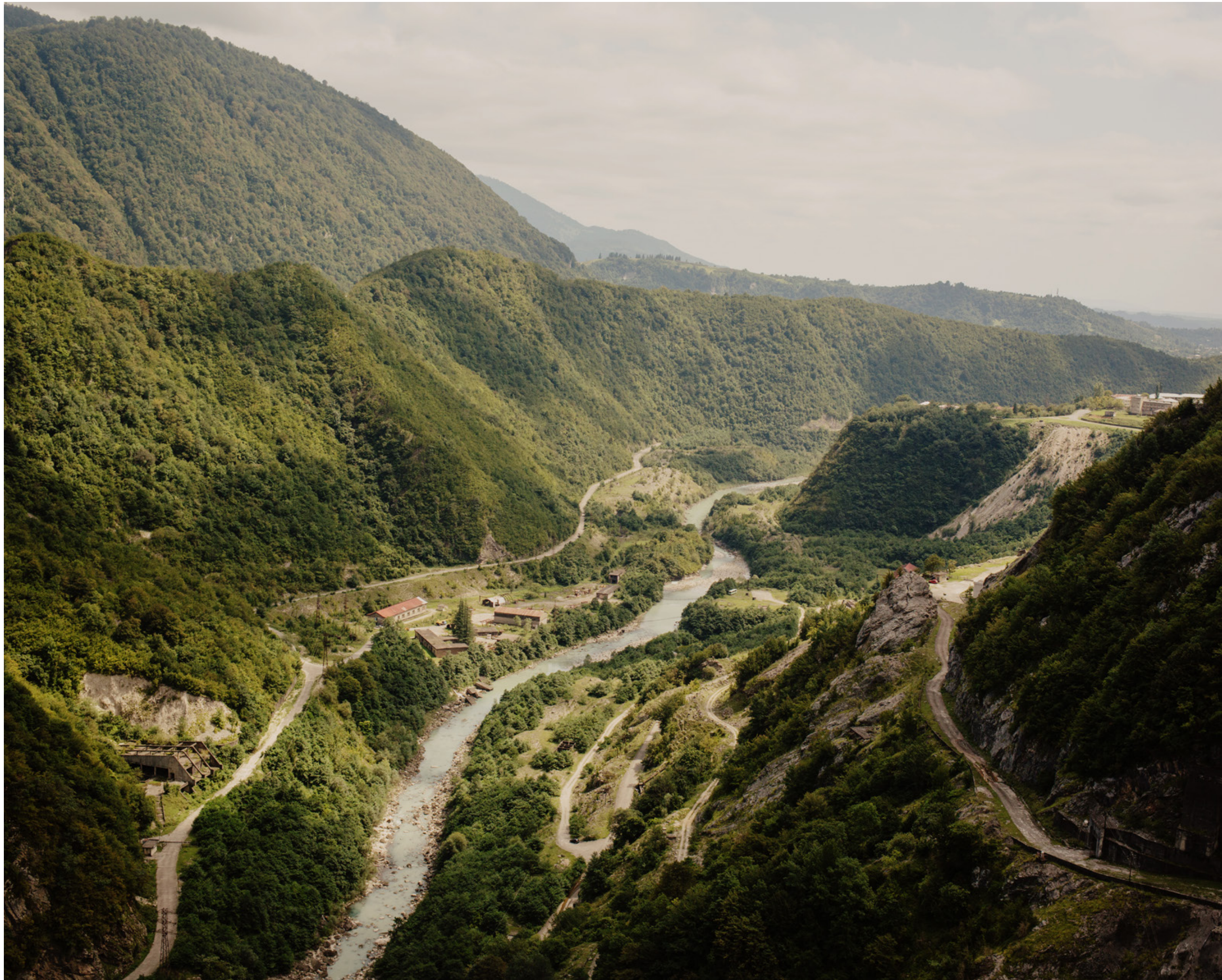
The Enguri river seen from the Jvari dam