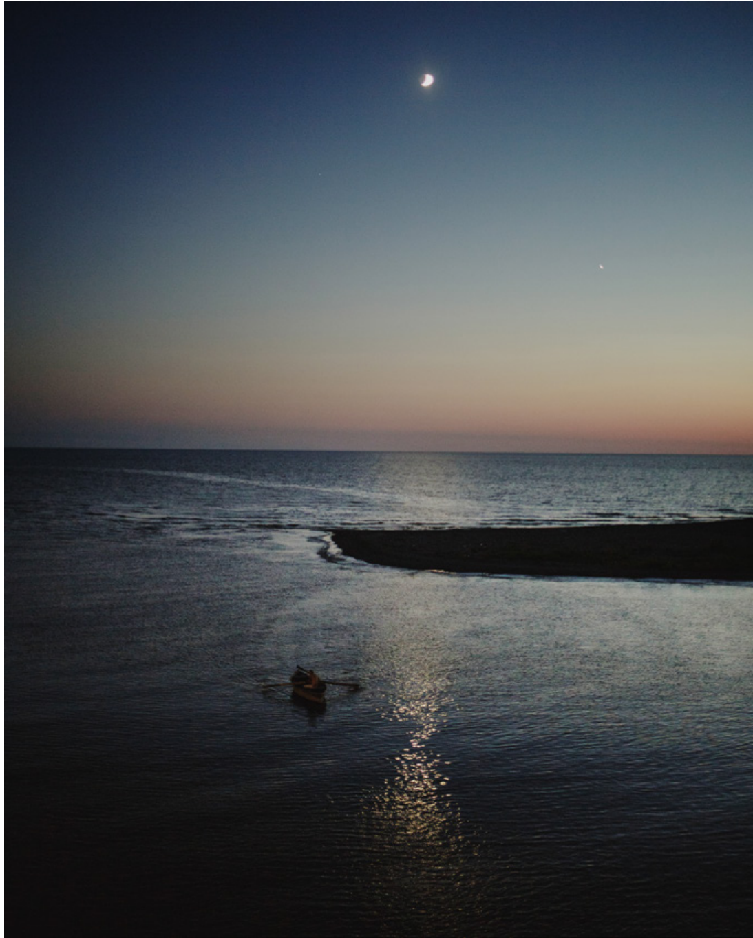
On the bridge between Anaklia and Ganarjiis Mukhuri, where the Enguri River meets the Black Sea