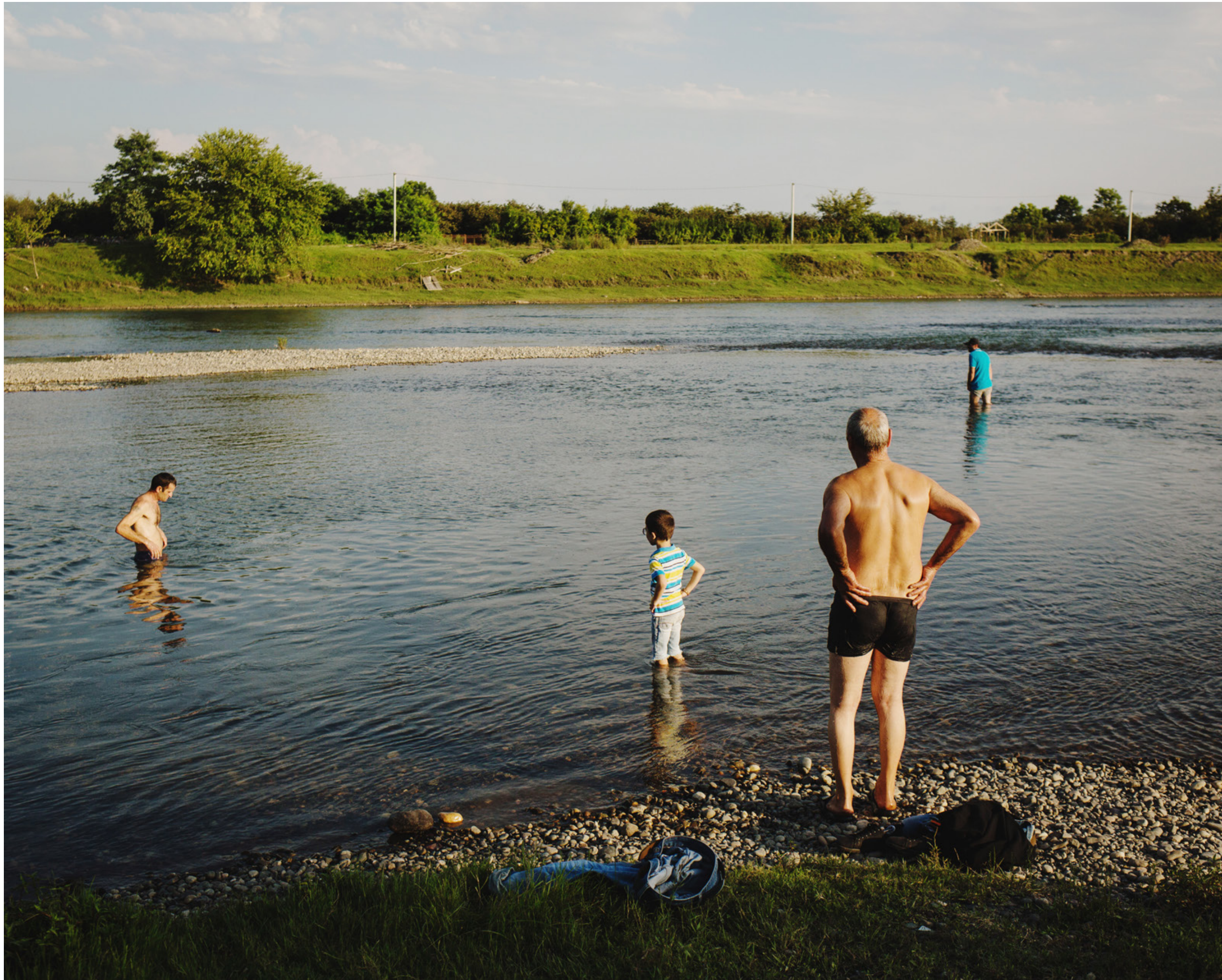
Ganarjiis Mukhuri, Samegrelo, Georgia - The village is located on the other shore of Enguri, the "border" with Abkhazia is one kilome- ter from the village.