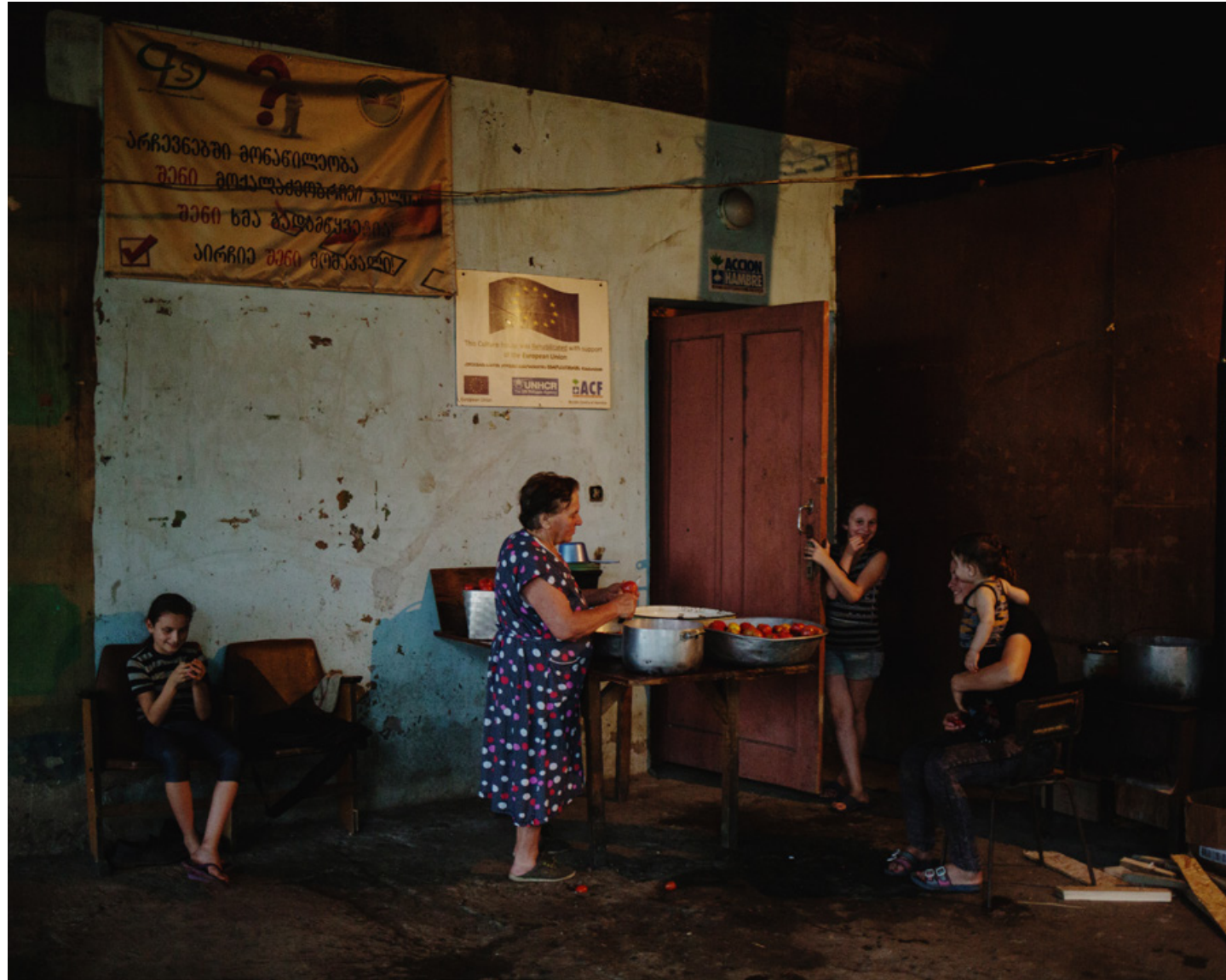
Shamgona, Samegrelo, Georgia - Refugees from Abkhazia living in a former building of the town hall. Today some municipal workers are still occupying some offices.