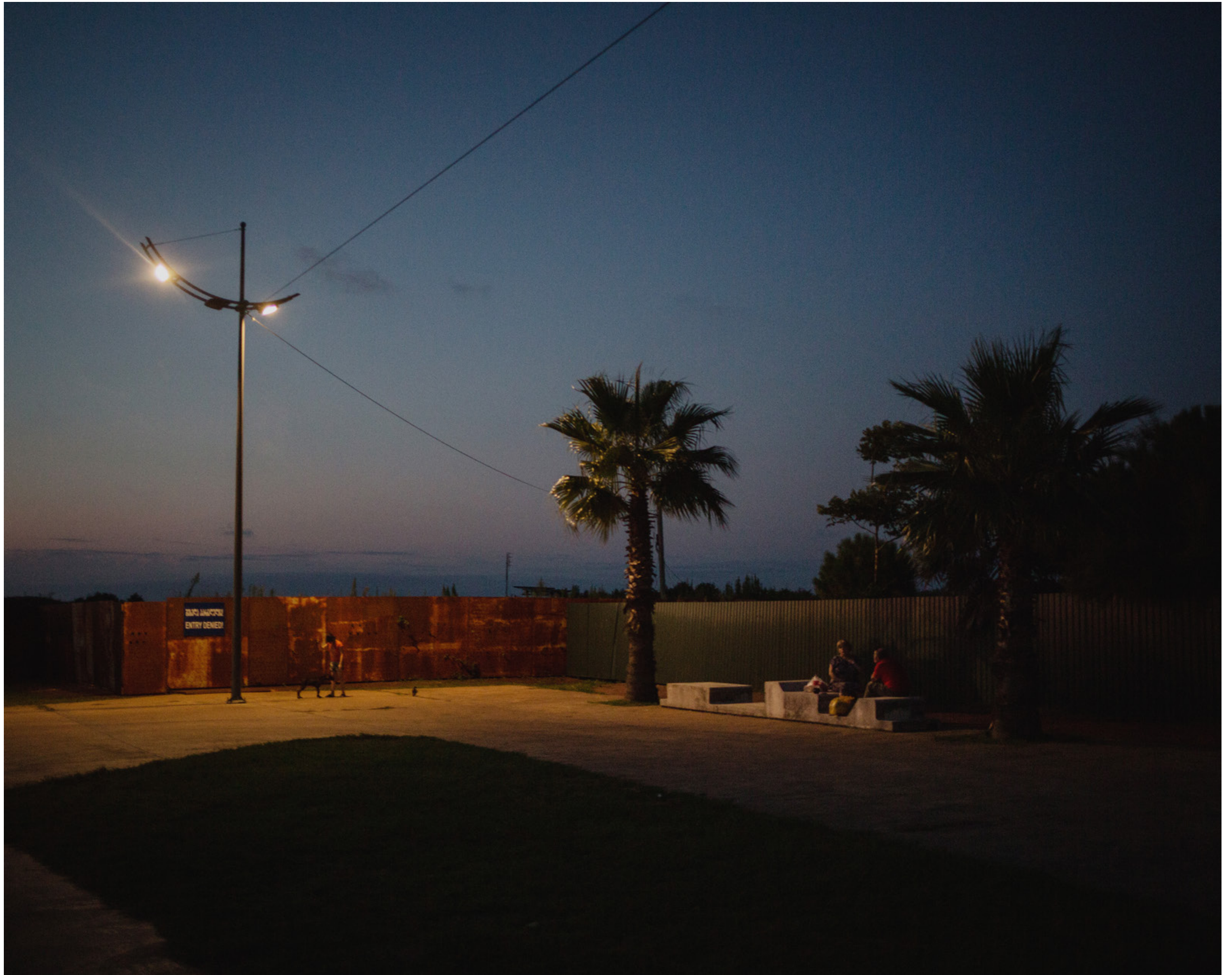
Ganarjiis Mukhuri, Samegrelo, Georgia – At the end of the beach, barriers are prevent- ing pedestrians to go further. A few meters after is the “border” with Abkhazia.