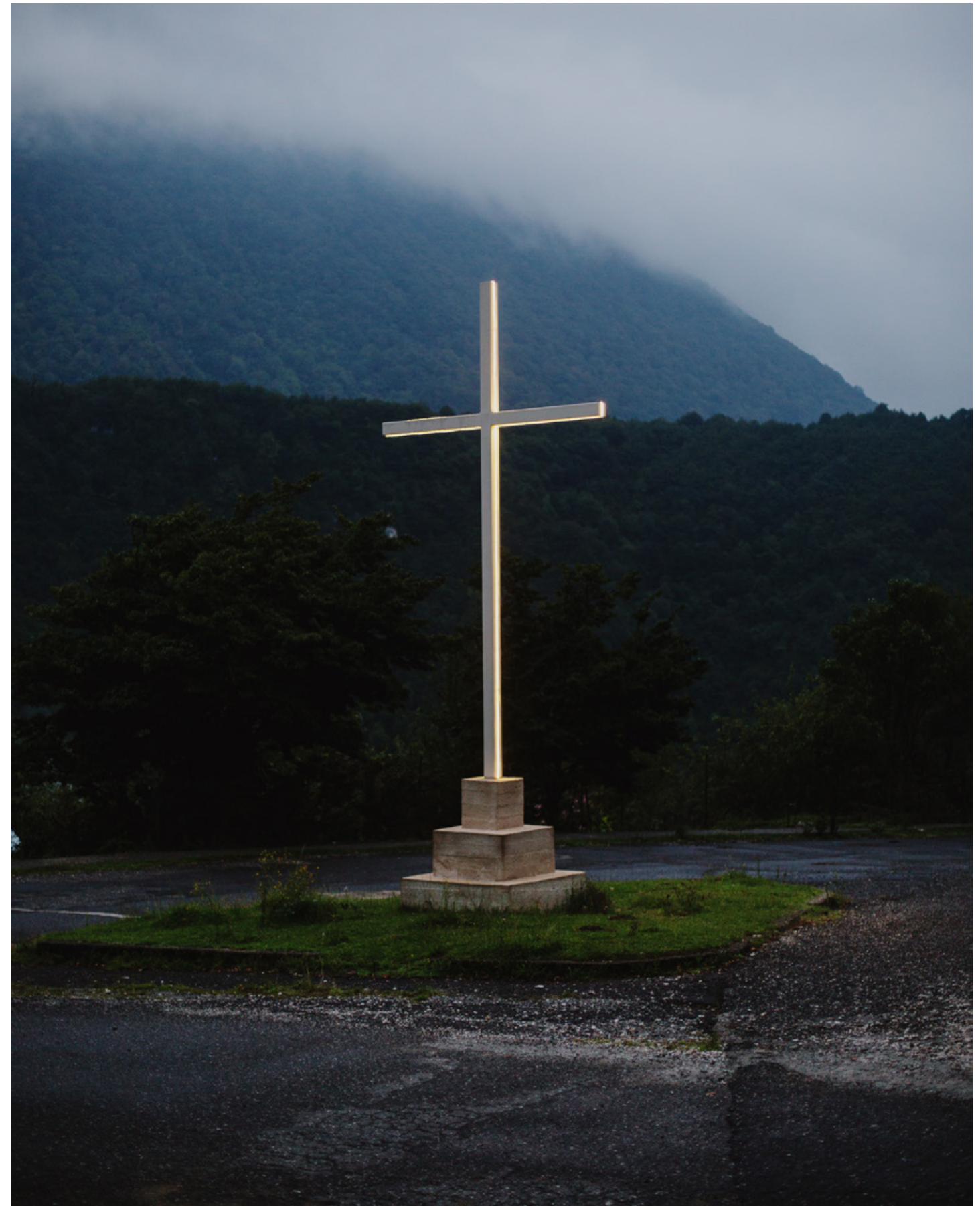
Potskho Etseri, Samegrelo, Georgia - Potskho Etseri is the former settlement of the Jvari dam workers. Today, only a few families of refugees are living here. The entrance of the village