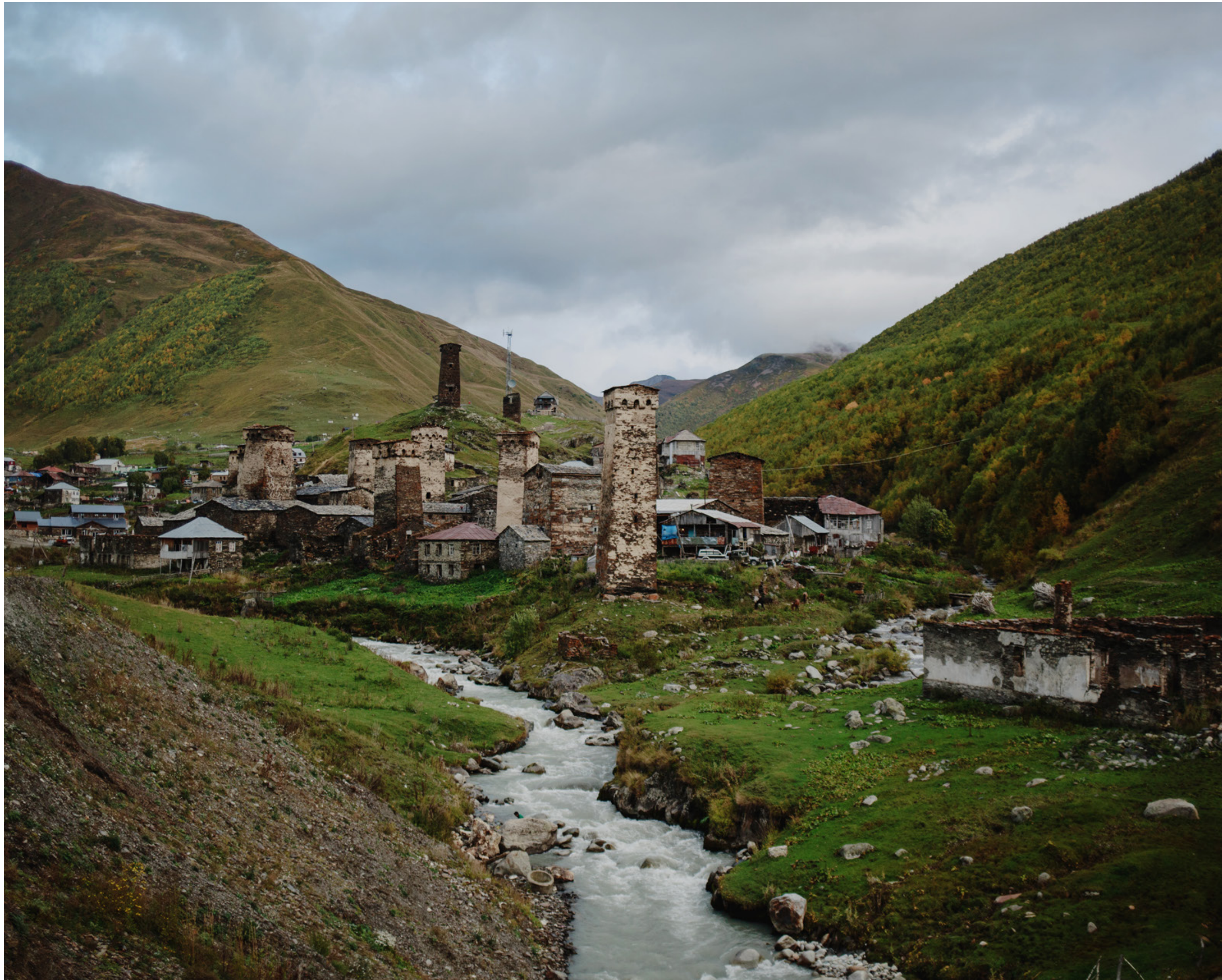
Ushguli, Svaneti, Georgia - Ushguli is the first village crossed by the river, it is a UNESCO World Heritage Site with its medieval defensive tower houses.