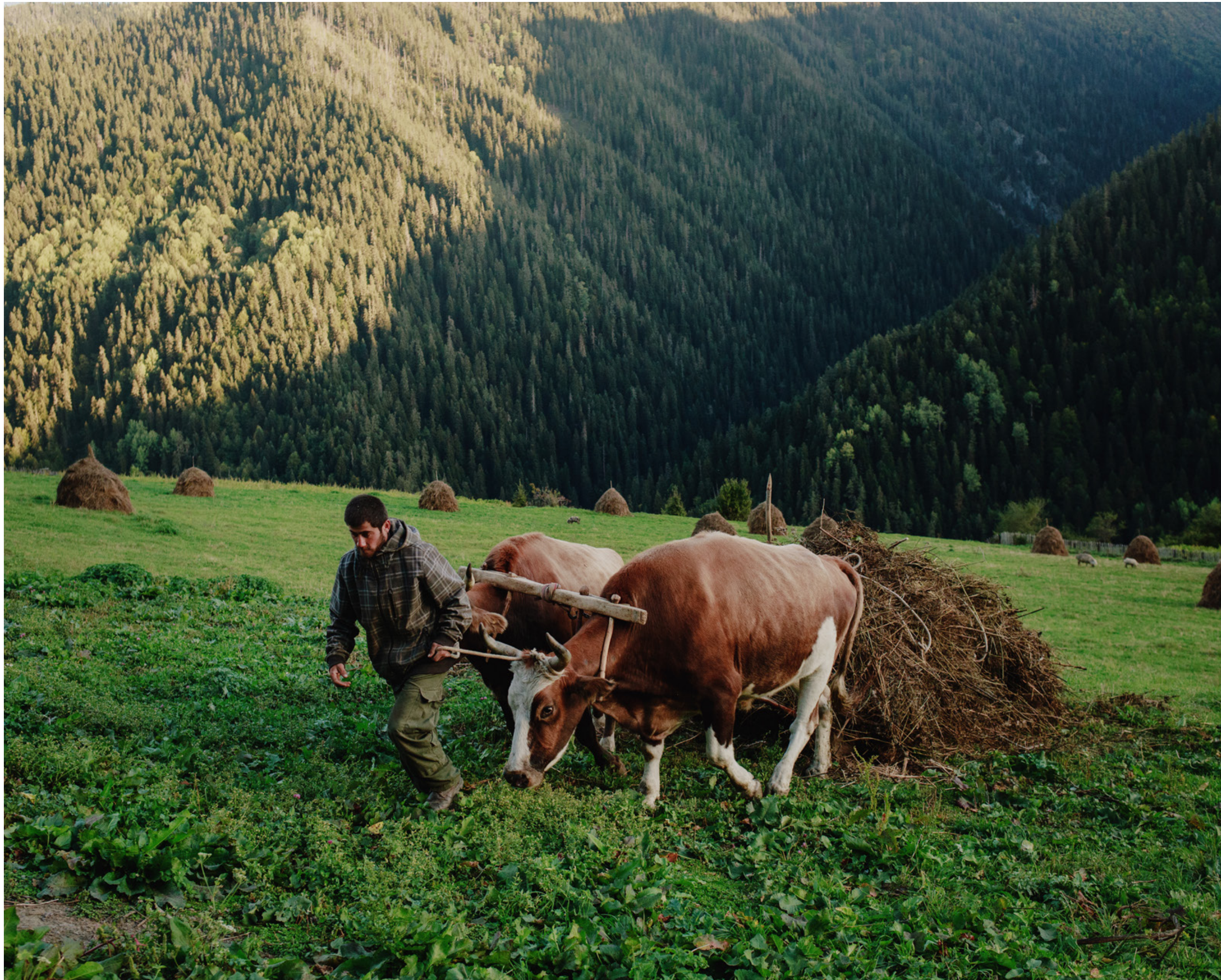
Ieli, Svaneti, Georgia - Because of topography, a lot of Svans are still using bulls to work in the fields.