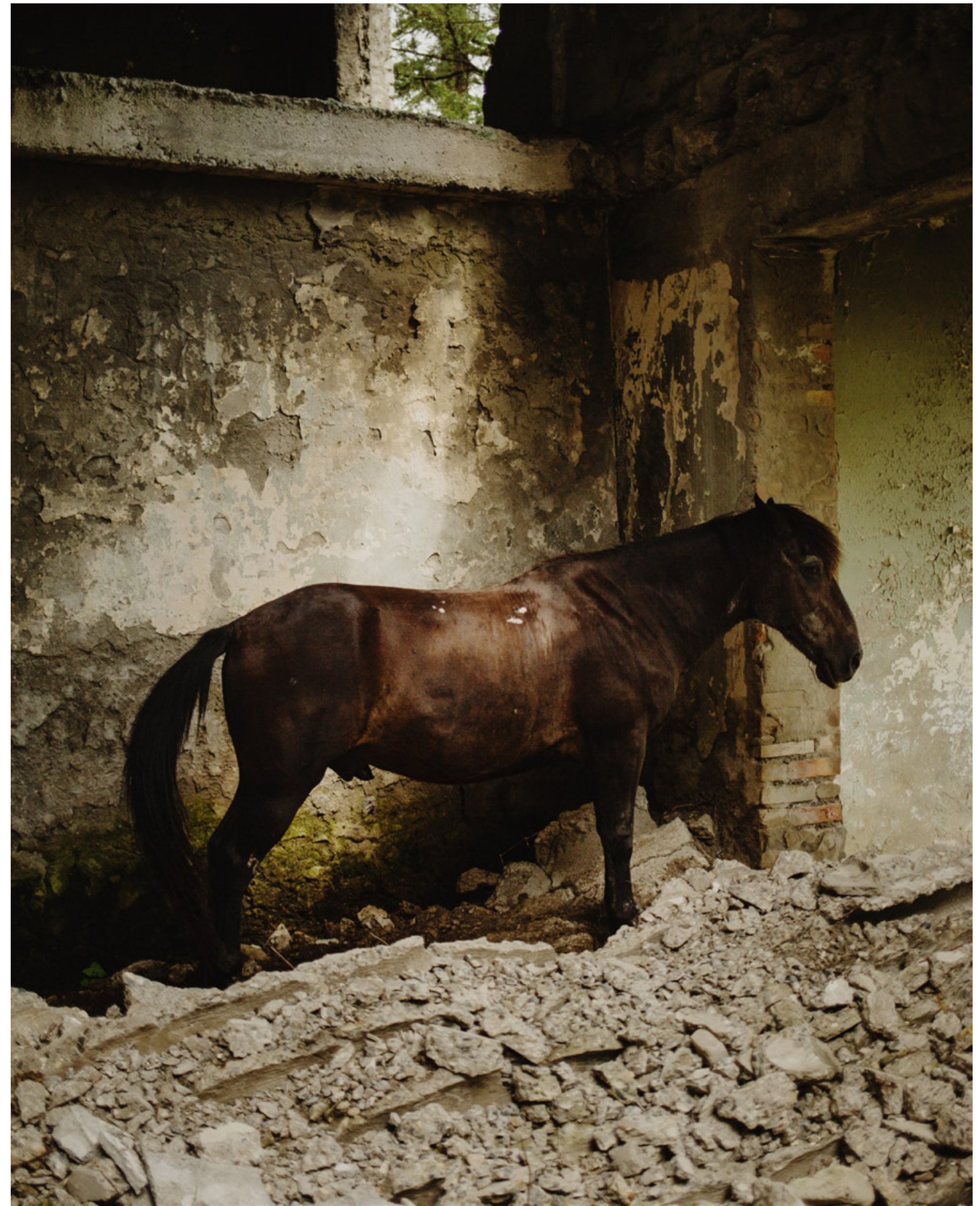
Potskho Etseri, Samegrelo, Georgia - Potskho Etseri is the former settlement of the Jvari dam workers. Today, only a few families of refugees are living here. An old derelict building.